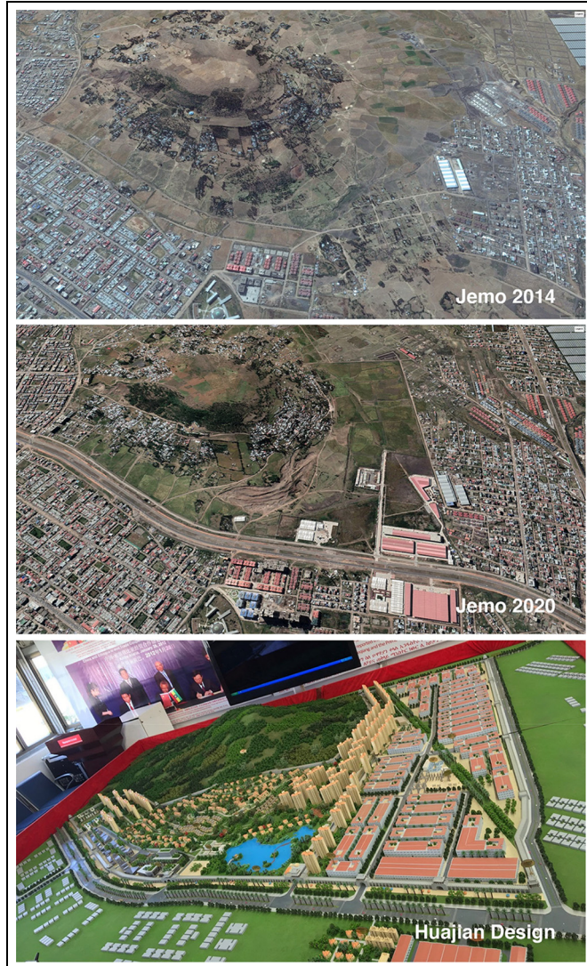
Figure I. Huajian Light Industry City and Jemo area.

Group engaged in what one senior representative termed ‘hundreds of pleas to different levels of government and millions of meetings’, as well as study visits to China, in order to acquire a letter from the Ministry of Industry to allow them to experiment with leasing land as a ‘special case’. Making sub-division a standard practice required