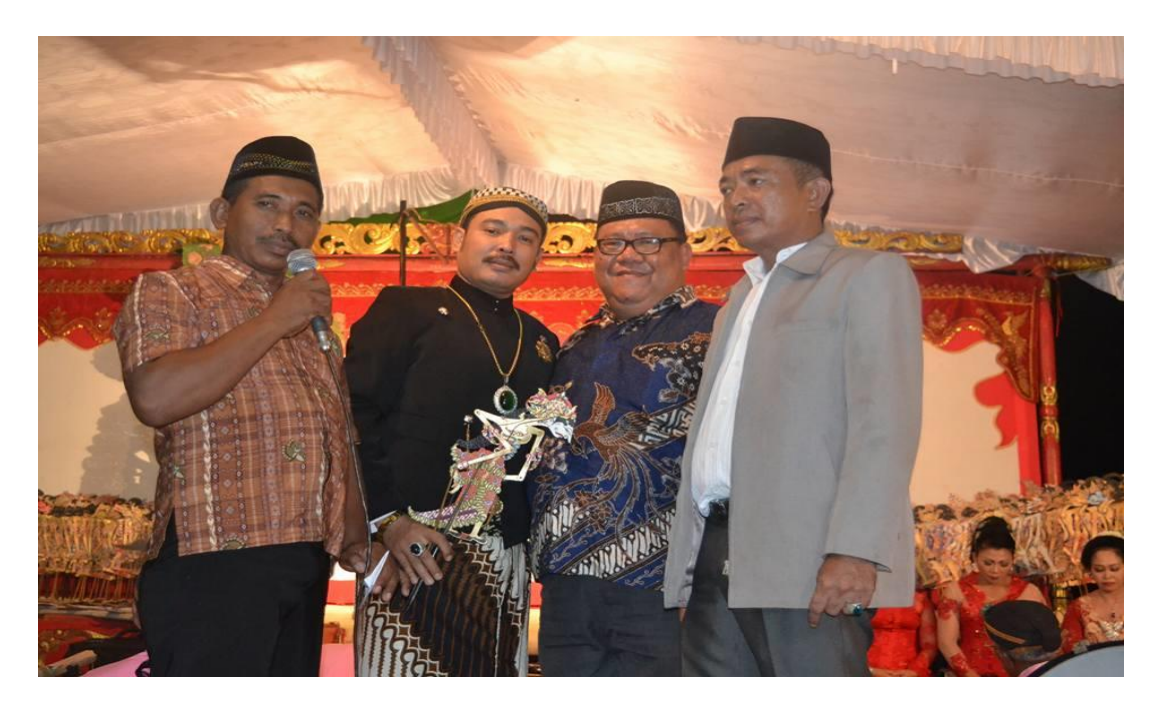
Figure 2 The Lampungese candidate for regent, posing beside Javanese shadow puppets during his political campaign<sup>65</sup>

campaigns and the holding of cultural and Javanese shadow puppet events are just some of the ways by which the Lampungese elite can stay close to the majority Javanese voters. One Lampungese candidate pointedly remarked, "You are asking me why I am speaking in Javanese and using a [Javanese] cultural approach? Indeed, this is based on the reality that they are in the majority and, politically, I want to win their hearts" (see Error! Reference source not found. ).<sup>64</sup> It can thus be presumed that the application of Javanese culture is another pragmatic strategy deployed by the Lampungese elite to obtain the sympathy of Javanese voters.