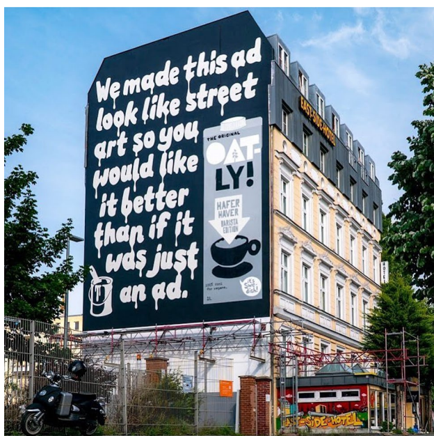
Fig. 6 Oatly billboards

as ‘it just becomes lame when you start preaching it in your communications’, but it also requires a veneer of transparency to acknowledge consumers’ distrust of advertising (Rogers 2019). Advertising commentator Jamie Williams (2019) explains how Oatly has pioneered a tactic known as ‘unadvertising’, which mocks the traditional advertising formula. This style takes the intertextuality of ironic advertising to another level, repurposing the subversive tactics of the 1990s anti-capitalist Adbuster movement in an effort to overcome widespread cynicism about the social role of advertising (Lasn 1999).