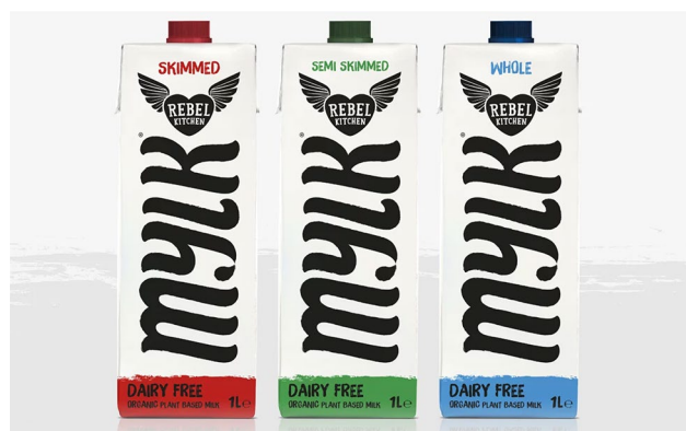
Fig. 5 Rebel kitchen cartons

brands, such as Oatly and Rebel Kitchen, offer ‘skimmed’ and ‘whole fat’ versions, in the latter of which fats are added to mylks (Fig. 5). This process is reminiscent of industrial dairy milk production, which skims all milk and adds fat back as needed.