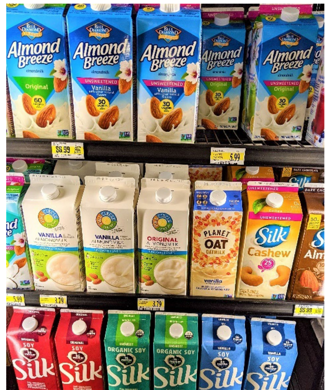
Fig. 3 Refrigerated mylk in supermarket.

When it comes to taste, some mylks (such as Rude Health and Plenish) claim to replicate the refreshing, 'pure' taste of (chilled) dairy milk, and to derive this purity from using only few ingredients. Many brands include flavorings, stabilizers, emulsifiers, and refined sugars in an effort to mimic the texture or mouth feel of milk. A carton of Rebel Kitchen Mylk exemplifies this, claiming 'what we all really want from a dairy free alternative is that it tastes & looks just like real milk. Right?' In trends comparable with dairy milk, many mylks are also flavored, most often with vanilla, in ways that explicitly depart from the claimed blandness of pure milk. As we examine in detail below, the form and style of the packaging often purposively resembles that of commodity dairy milk. Mylks are also sold in ways that resemble dairy milk, located in refrigerated aisles adjacent to dairy milks (Fig. 3) or next to the UHT milks in the ambient aisles. Likewise, in coffee shops, which have proven to be crucial spaces in which consumers first try mylk, they are sold with