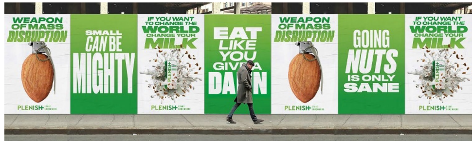
Fig. 1 PlenishDrinks advertisement