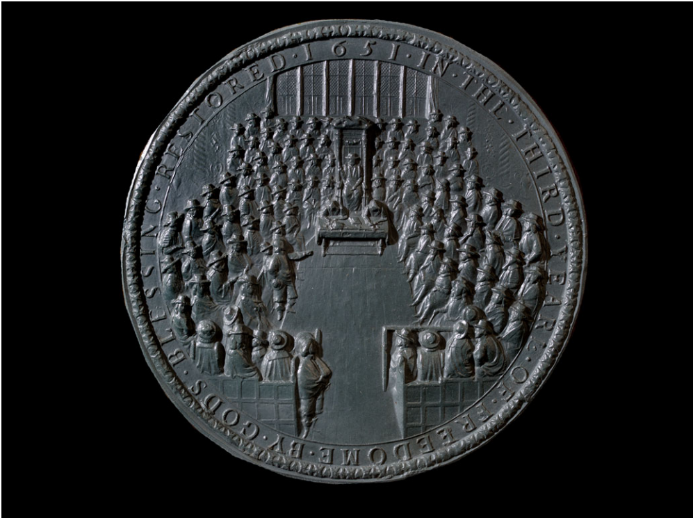
Fig 2. Thomas Simon (engraver), second Great Seal of the Commonwealth (1651), reverse, House of Commons in session. Photograph : seal impression, courtesy of the Society of Antiquaries of London, LDSAL A32.

history of representations of royal and parliamentary power dating back to the Reformation era, helping us to understand its radical design; and the architectural and political culture of the Palace of Westminster since the conversion of St Stephen's Chapel to become the first permanent and dedicated House of Commons. Prints and engravings play a part in this story, but so too do parliamentary ceremony and the self-perception of the members who gathered in the Commons chamber. 7