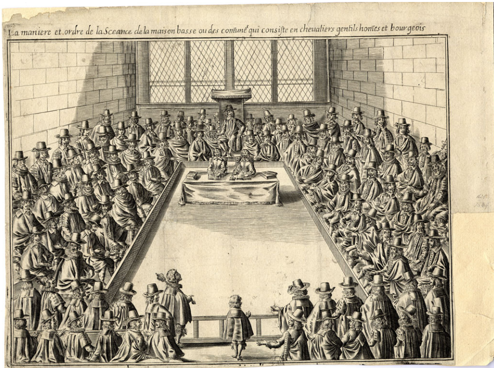
Fig 6. Unknown engraver, 'La maniere et ordre de la Sceance de la maison basse ou des com[m]unes qui consiste en chevaliers gentils hom[m]es et bourgeois', c 1641–50, print.

provided the bare bones of a structure of authority over which was draped the surface gilding of early modern monarchy'. 74 If the revolutionary iconography of the republican Great Seal did not announce the truly radical new regime that some outside the Commons were agitating for, then this was consistent with what Blair Worden has described as the 'trail of disillusionment and resentment among the advocates of social and religious reform' left by the Commonwealth. 75 The simple fact of the Great Seal's continued existence, with its centuries of history and embedded procedures and fees, argues for the limitations of the legal reforms attempted by the Rump Parliament. Radical in design, the Commonwealth Great Seal at the same time signalled an underlying continuity in law and government: revolution in the pre-Enlightenment sense of a turning back to a pre-existing state of affairs, in this case the primacy of a House of Commons that (in the perception of members, at least) could be dated back a century and more. So it was that the image of the Commons chamber, already familiar from pamphlets and engravings, acted to reassure office-holders in the localities and other recipients of the Great Seal that not all the world had been turned upside down.