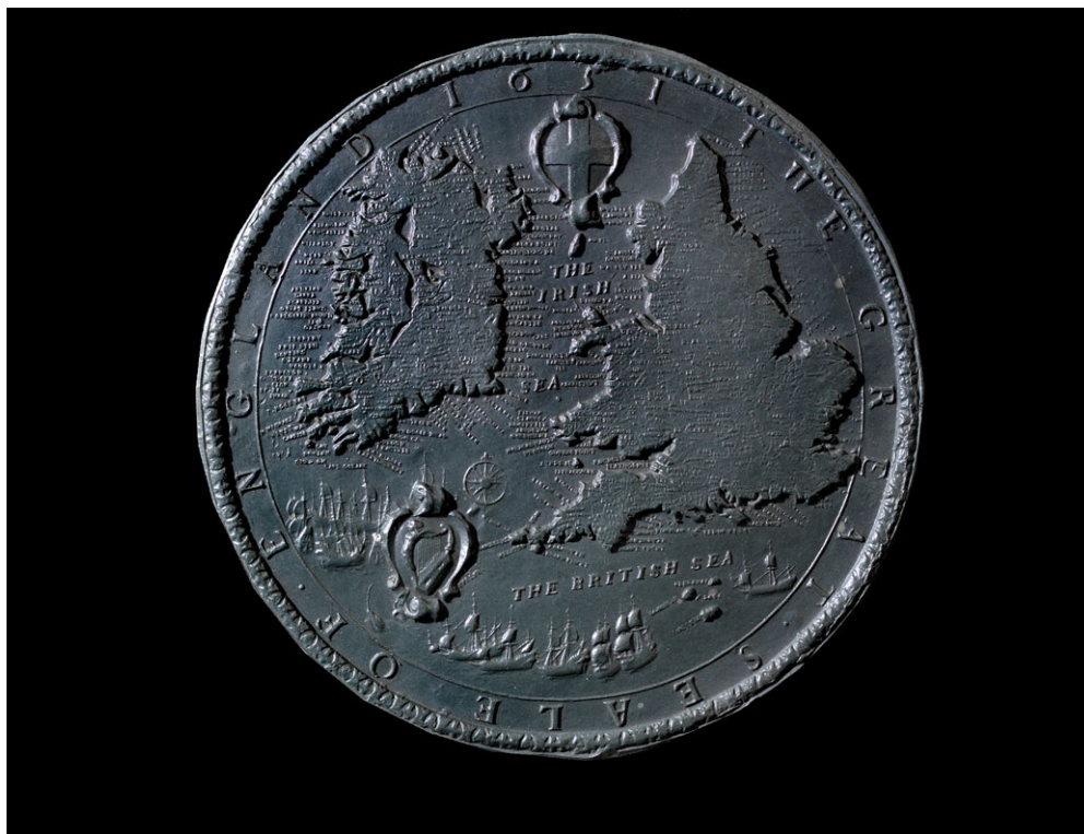
Fig 1. Thomas Simon (engraver), second Great Seal of the Commonwealth (1651), obverse, map of England, Wales and Ireland. Photograph : seal impression, courtesy of the Society of Antiquaries of London, LDSAL A32.