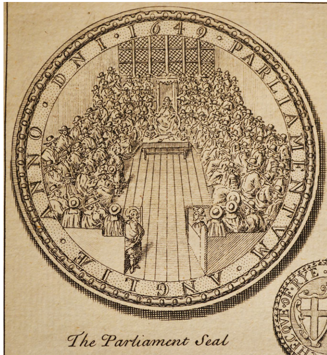
Fig 3. Thomas Simon (engraver), seal of the Parliament of England, 1649 (Vertue 1780, plate v).

statue of Charles erected in 1629 to conclude the sequence of monarchs at the Royal Exchange. On 31 July 1650 the Council of State ordered the mayor and aldermen that the statue should be ‘demolished by having the head taken off and the Sceptre out of his hand, and this inscription to be written Exit tyrannus Regum ultimus Anno primo restituae Libertatis Angliae 1648 [so passes the last tyrant, in the first year of the restored freedom of England 1648]’. 62