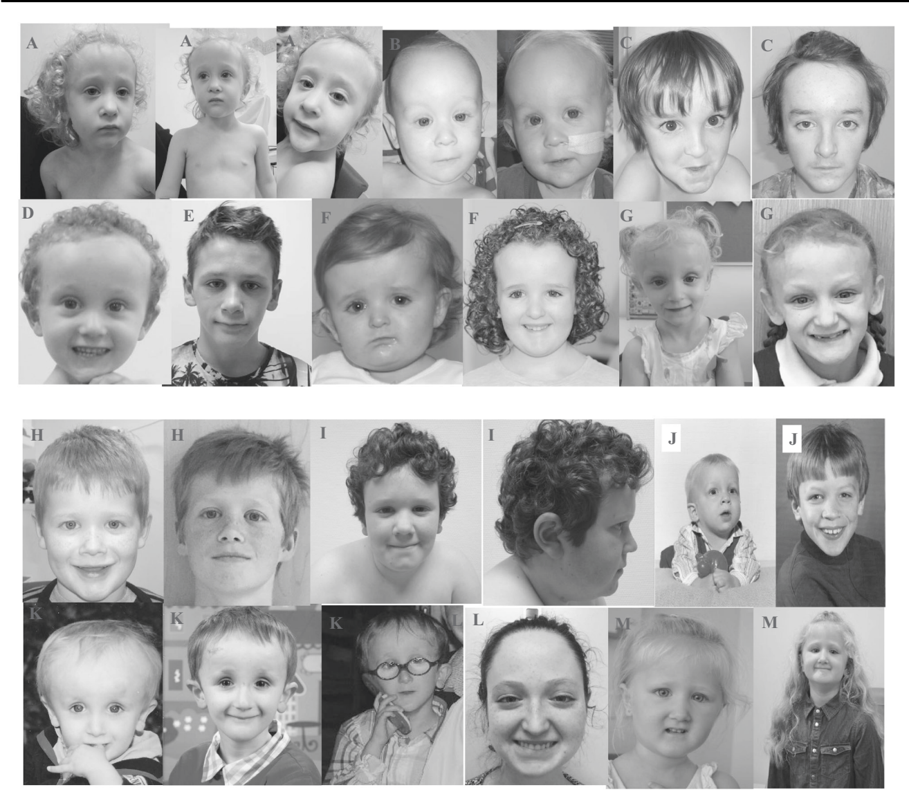
Fig. 1 Characteristic facial appearance of patients with variants in SIN3A. Note the high forehead, small, pointed chin and down-slanting palpebral fissures. A: Patient 1, B Patient 2, C Patient 4, D Patient 5, E