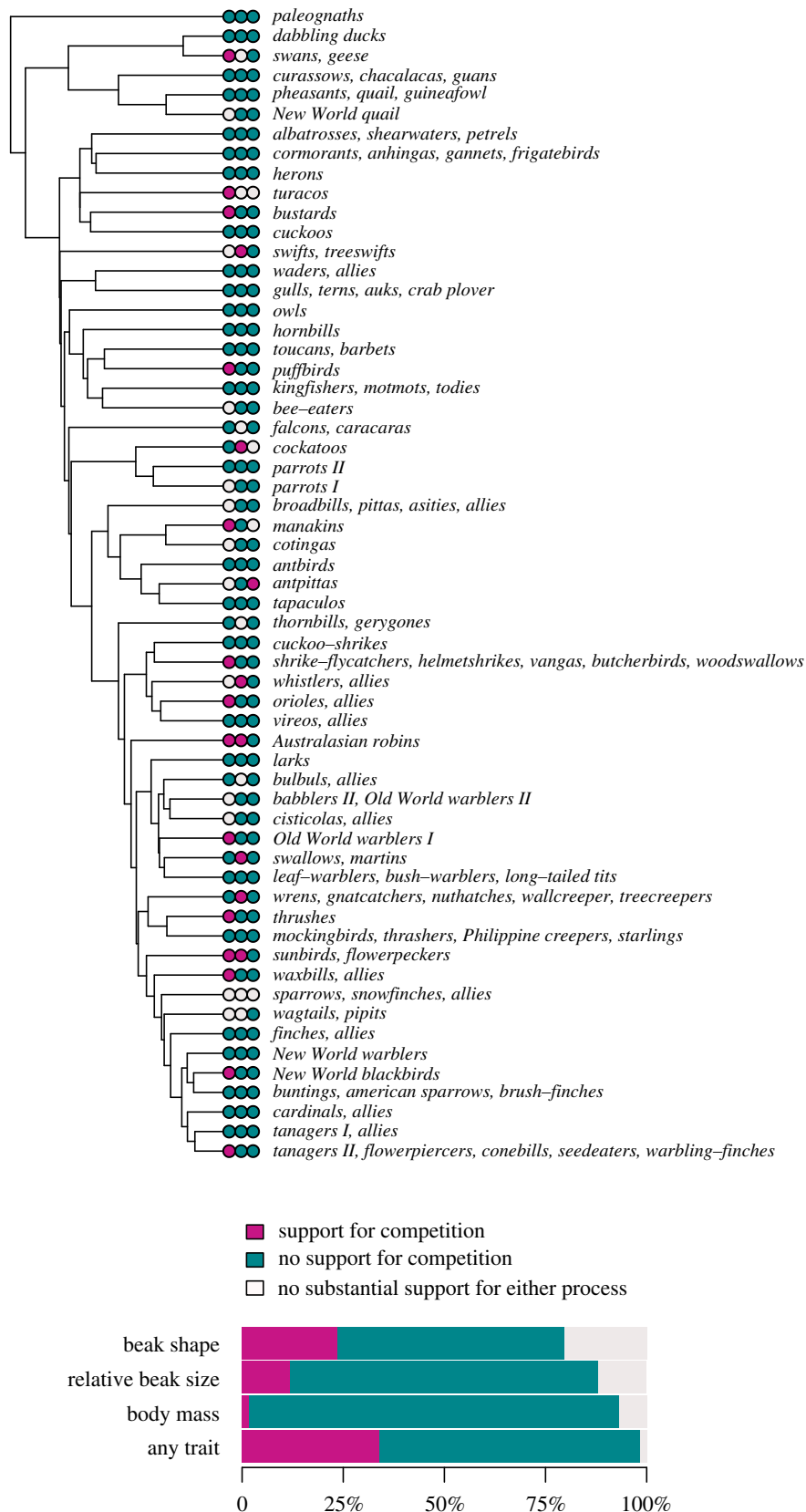
Figure 2. The signature of competition across 59 avian orders and super-families. Support for competition (purple) is determined by whether a diversity- or trait-dependent model best explains the data in the focal clade, with an AICc difference greater than two compared with any model assuming lineages evolve independently. The following ecomorphological traits are considered (left to right circles): beak shape (purple indicates the signal of competition in either PC1, PC2, PC3 or PC4), relative beak size and body mass. Twenty out of 59 clades show support for competition in either beak shape, size or body mass ('any trait' in the stacked bars). Clades where models with and without competition cannot be distinguished by an AICc difference greater than two are marked by light grey. (Online version in colour).

and 6 for the MC) in either beak shape, size or body mass (electronic supplementary material, figure S4). The electronic supplementary material, appendix S4 provides estimated model parameters and model fit for each clade.