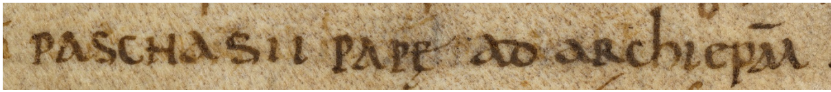
Figure 2. Bamberg Staatsbibliothek, Msc. Can 4, fol. 146v: detail of the palimpsested rubric

but there are any number of possibilities for the text's original form, so we should be cautious about speculation.