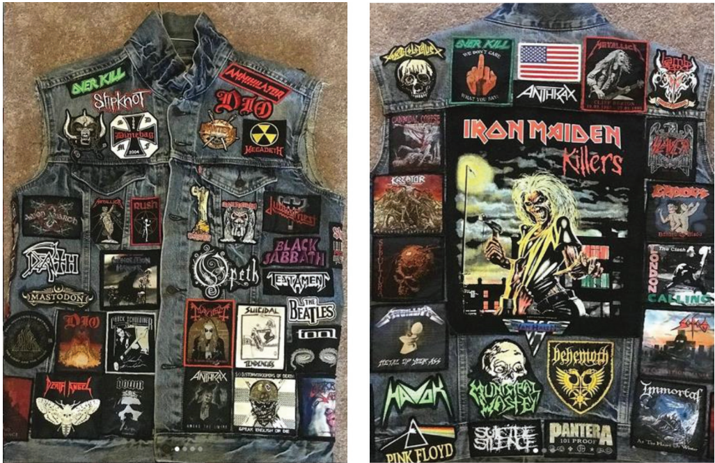
Figure 1. An archetypal battle jacket.

biographies” that are central to a person’s sense of identity and web of memories (Kopytoff, 64) (Figure 1).