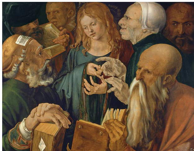
["Christ Among the Doctors" by Albrecht Dürer (1506), public domain] 15

We cap off the focus on texts with a turn to art. We examine how Judeophobia becomes so common in the European world that it leads to artistic products such as this: