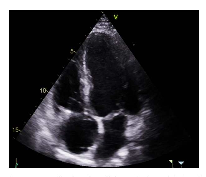
Figure 5: Post-operative echocardiographic images showing repaired tricuspid valve.