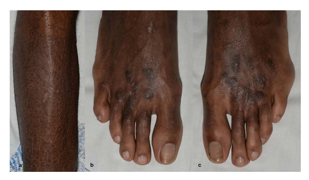
Figure 3: Atopic dermatitis, excoriation and erosion in right shin secondary to xerosis and chronic itching (a) and symmetrical lichenification on both feet (b and c).