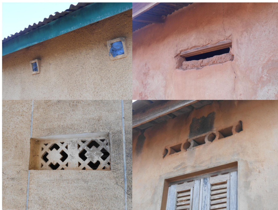
Fig. 3 Examples of ventilation bricks commonly found in the study area in central Côte d'Ivoire. These are often either left unscreened, or blocked (e.g. with LLINs, as shown in the top left image)

The decision was made to use a pyrethroid insecticide for this CRT, despite intense pyrethroid resistance in the study area. The rationale for this decision was two-fold: first, pyrethroids are a relatively safe class of insecticides with low mammalian toxicity and second, of all the candidate actives evaluated in preliminary testing, the beta-cyfluthrin formulation had the highest bioassay mortality for the longest period of time when tested with local, field collected, pyrethroid resistant mosquitoes (Oumbouke, unpublished observations). The efficacy of a pyrethroid against resistant mosquitoes is not surprising, given that the delivery method (i.e. a powder formulation