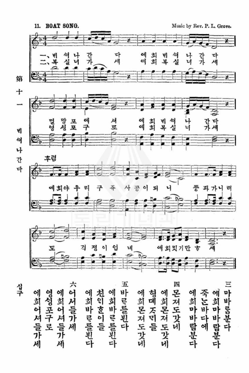
Figure 4. "Boat Song," Ch'yanggajip (1915). Independence Hall of Korea.

The folkloristic consciousness of Ch'yanggajip crosses into self-conscious syncretism. Most notably, the imagery of a boat departing "the port of destruction" ( myŏlmangp'o ) and the recasting of "the lord" as the boatman ( uri kujyu sagong i toeni ) may be read as an attempt to