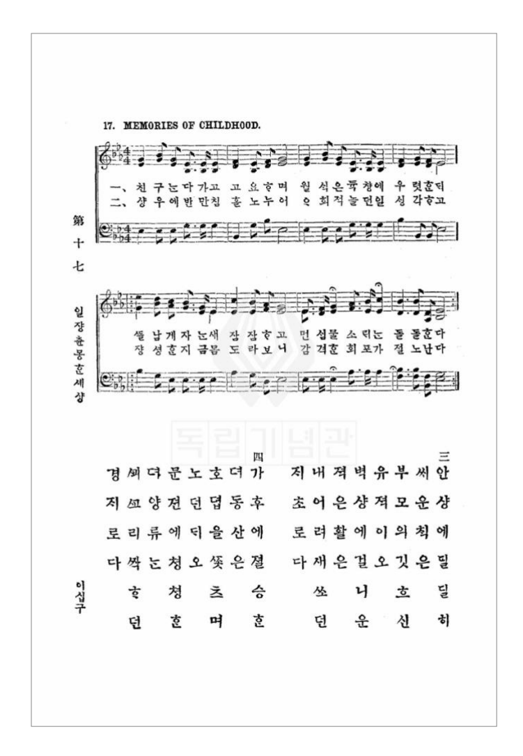
Figure 2. "Memories of Childhood," Ch'yanggajip (1915). Independence Hall of Korea.

What we see in these redolent songs are the tropes of romantic nationalism generally attributed to the nineteenth-century West, in which the awakening of the national subject is connected to a reflexive experience of space and time. With regard to Korea, this kind of representation is typically traced to "national" literature emerging in the early twentieth century, particularly Yi Kwangsu's Mujŏng ( The Heartless ), but what is intriguing is that Ch'yanggajip predates Mujŏng by two years. Mujŏng , no doubt a product of Yi's studies in Japan, nevertheless exhibits considerable overlap with the self-reflective songs in Ch'yanggajip . As Michael Shin