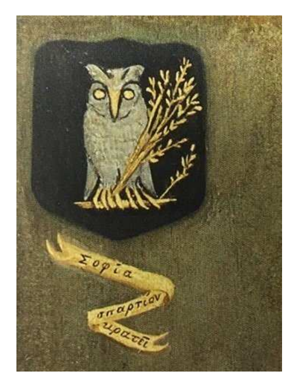
Figure 1. Detail, Marie Spartali Stillman, The Lady Prays-Desire, 1867. Watercolour with gold paint on paper, 419 x 305 mm. Private collection. Low-resolution detail photograph of out-of-copyright artwork used under fair dealing for critique or review.

"spartíon"'. By combining this translation with the iconographic content of the cartouche— an owl holding some kind of branch— with a bit of judicious Googling, we found that 'spartíon', or Spartium, is the Latin name for Spanish broom, a leafy shrub with bright golden flowers that is clearly identifiable as the plant held by the owl (Fig. 2). With the pun on Spartali , it becomes clear that the cartouche and motto go beyond merely 'invok[ing] Spartali Stillman's Greek heritage'.<sup>5</sup> Rather, she directly places herself in the grasp of Wisdom, and Athena, who was not only the goddess of wisdom and war, but also artistry and crafts. On a painting described as 'personifying not beauty but ambition', and an allegorical figure who 'aspires to honour', through the character of Lady Prayse-Desire from Edmund Spenser's The Faerie Queene , the symbolism of the artist textually and visually placing herself in the grasp of Athena on the picture plane is clearly directly relevant to the content of the picture.<sup>6</sup>