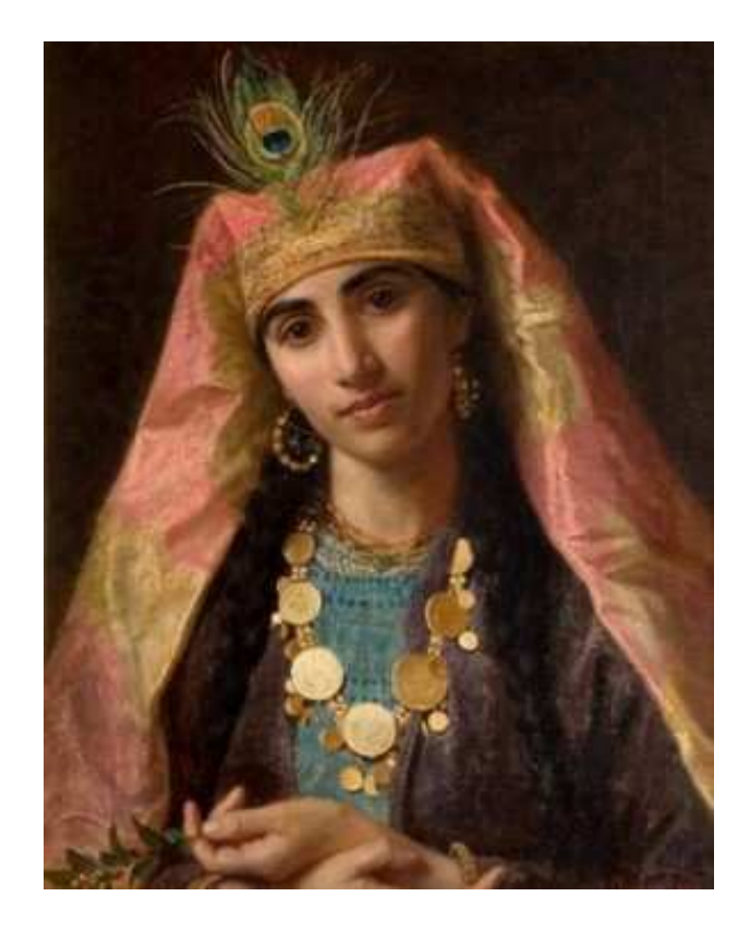
Figure 1. Sophie Anderson, Scheherazade , n.d., Oil on canvas, 50 x 41 cm.