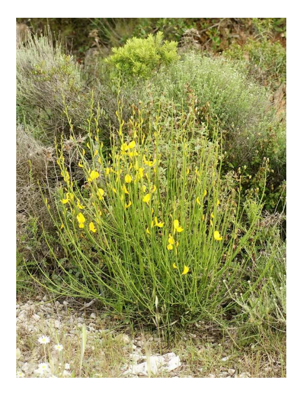
Figure 2. Spanish broom near Perasdefogu , Sardinia, Italy. © Hans Hillewaert, 2008. Licensed under CC BY-SA 3.0.

Apollo and the crowns given to victors in poetic competitions. These symbolic interplays reinforce the character of the Lady Prayse-Desire from Spenser's poem. The Lady Prayse-Desire tells the Prince, 'Pensive, I yeeld [sic] I am, and sad in mind, / Through great desire of glory and of fame'; another figure gives the Prince her name: 'her name was Prayse-desire, /That by well doing sought to honour to aspyre'.<sup>7</sup> Spartali Stillman's painting is a pictorial and textual claim to Athena's protection and Apollo's glories.