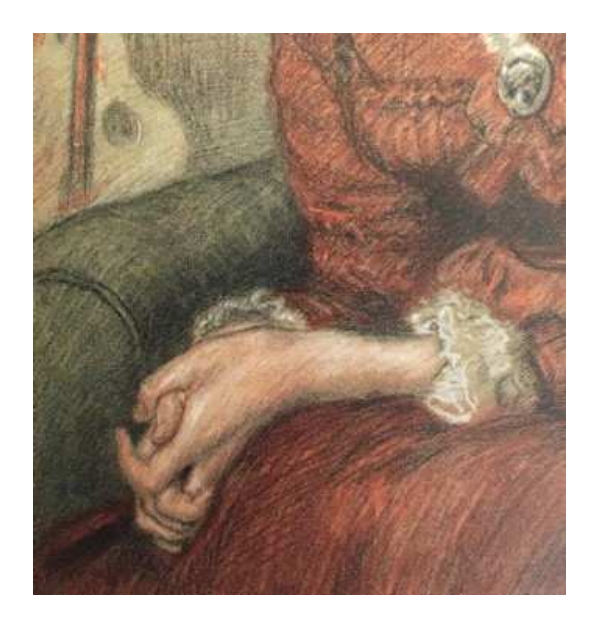
Figure 4. Detail, Ford Madox Brown, Portrait of Marie Spartali Stillman , 1866/7. Chalk on paper, DIM. Private collection. Low-resolution detail photograph of out-of-copyright artwork used under fair dealing for critique or review.

Figure 3. Detail, Ford Madox Brown, Portrait of Marie Spartali Stillman , 1869. Coloured chalks on paper, 775 x 559 mm. Private collection. Low-resolution detail photograph of out-of-copyright artwork used under fair dealing for critique or review.