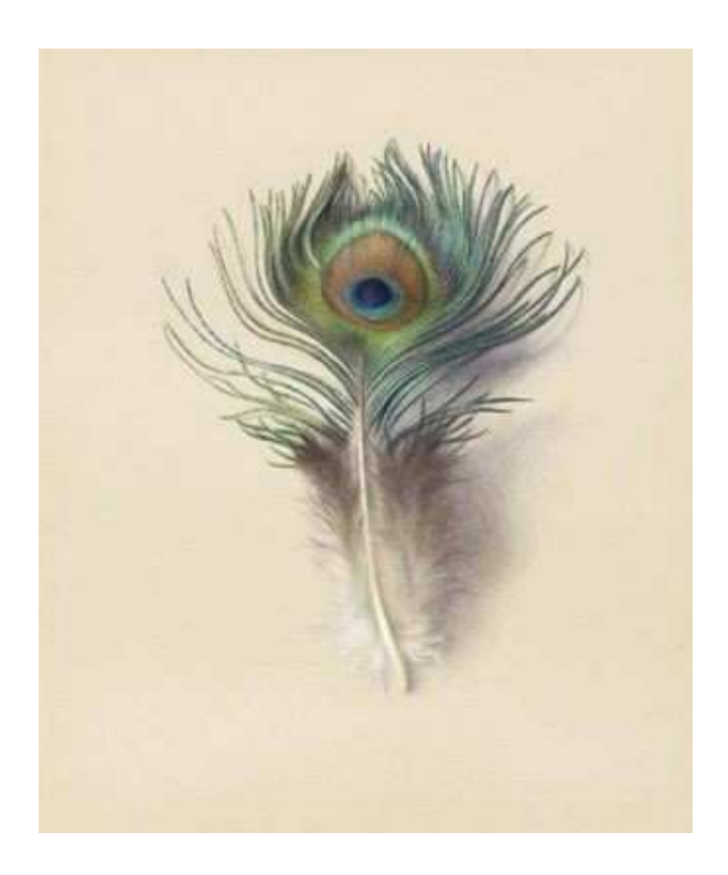
Figure 2. John Ruskin, Study of a Peacock Feather , c. 1880, Watercolour on paper, dimensions not given.

Figure 1. Sophie Anderson, Scheherazade , n.d., Oil on canvas, 50 x 41 cm.