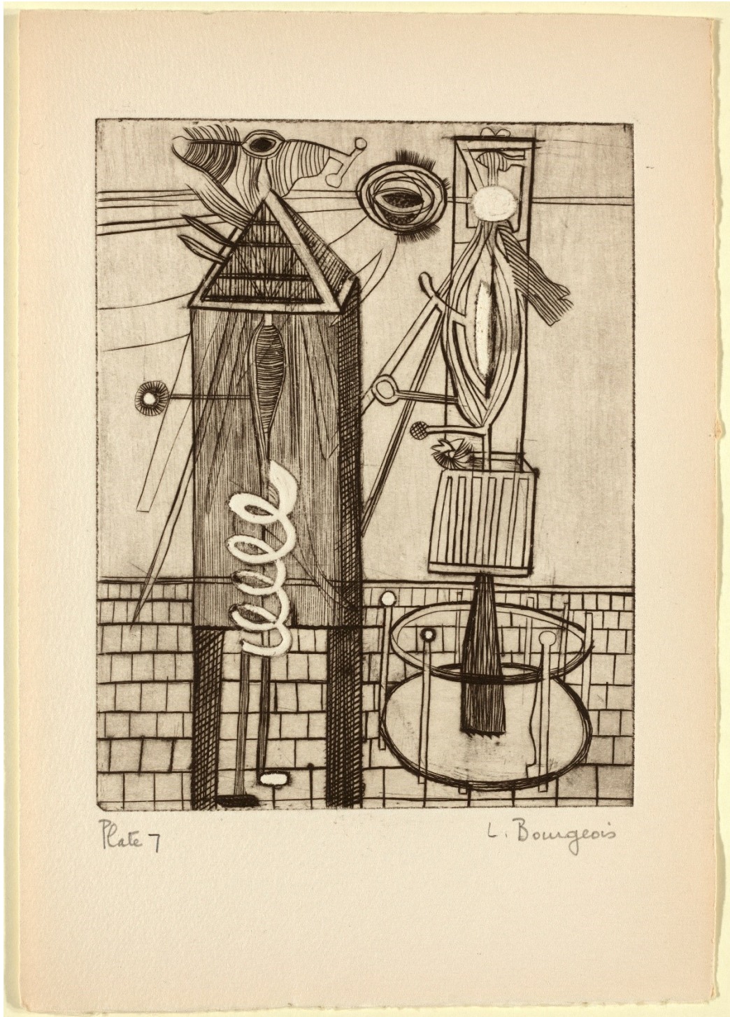
Figure 2. Louise Bourgeois, He Disappeared into Complete Silence , Plate 7, 1947, book of nine engravings and letterpress text on paper, 25.4 x 35.5 cm, National Gallery of Art, Washington, D.C. © The Easton Foundation/VAGA at ARS, NY and DACS, London 2020.