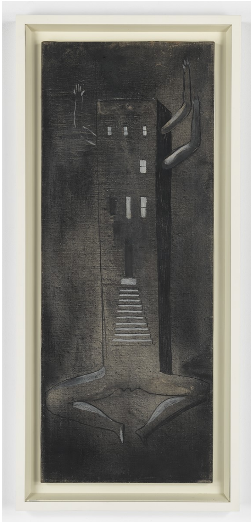
Figure 1. Louise Bourgeois, Femme Maison, 1946-1947, oil and ink on linen, 91.4 x 35.3 cm, Collection Louise Bourgeois Trust, New York.