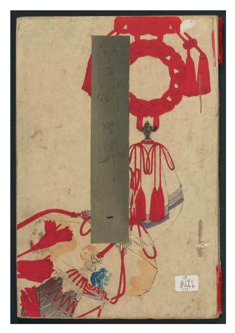
Figure 8. Watanabe Seitei, ed., Bijutsu Sekai (The Art World), vol. 1, front cover, 1890, woodblock-printed.

regarded as independent. It appears to have been grounded in his belief in the necessity of a unified national artistic tradition, instead of individual schools of aesthetics.