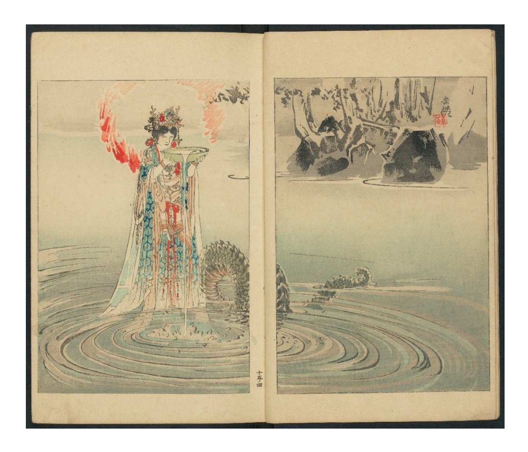
Figure 9. Kubota Beisen, Shinsen'en Ryūjo Shutsugen (a depiction of the rain-god dragon Zennyo Ryūō) in Bijutsu Sekai, vol. 24, 1893, woodblock-printed.

The last volume, 25, was an album specifically dedicated to Seitei's own kachō-ga works. In addition to kachō-ga in a narrow sense, it included origami cranes, departing from the strict interpretation of kachō-ga that only included realistic paintings of flora and fauna. This volume also included one particular image on pages 22–23 that resembled a natural history painting or a study for further creation, depicting details of birds in several different styles. However, exceptions apart, most of the volumes of the series featured various genres of paintings. Another interesting point is the selection of certain images from the past; these selections were also quite varied and not limited to certain types of objects or art. Screens, fans, hanging scrolls, prints and calligraphy were all featured.