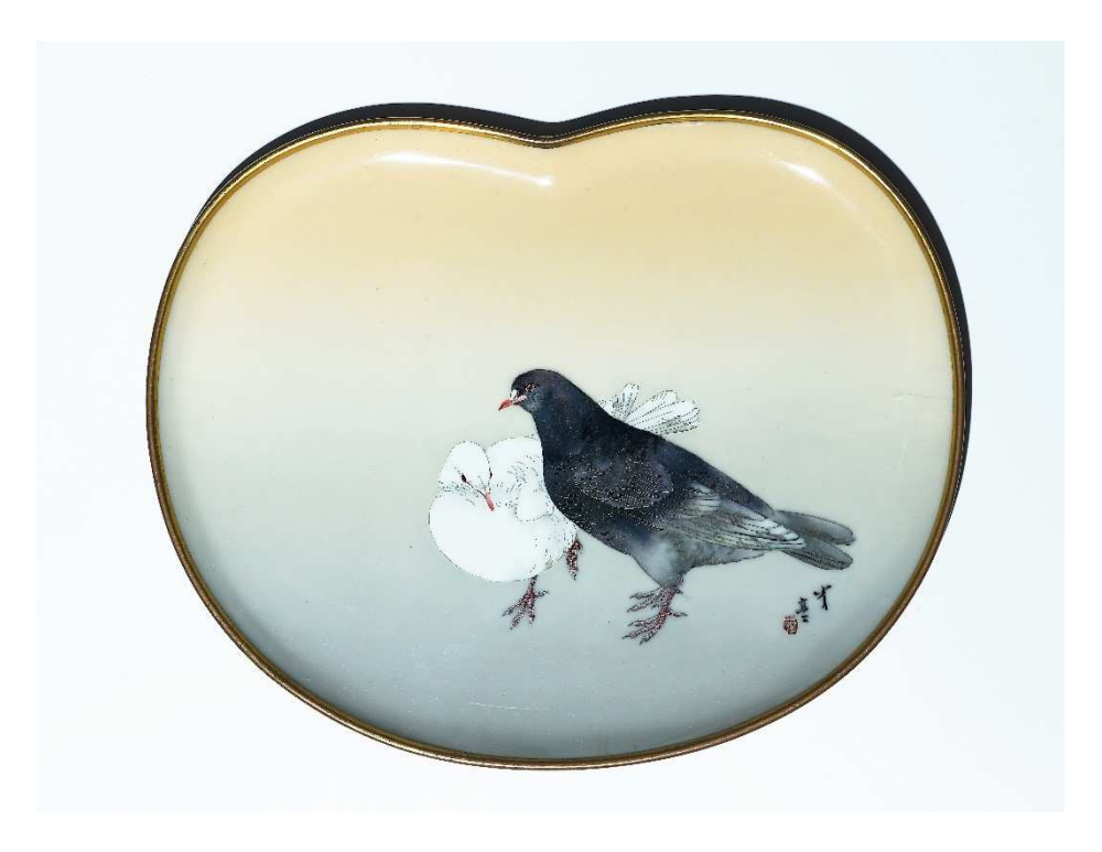
Figure 1. Namikawa Sōsuke, after Watanabe Seitei (manufactured by Tokyo Cloisonné Company), kidney-shaped tray with two pigeons, c. 1880, copper, inlaid with gold and silver wire cloisonné enamel, 24.5 x 30 x 1.8 cm, Ashmolean Museum, Oxford.

enamelware to be enhanced, allowing the accomplishment of pictorial designs that included birds, flowers, and landscapes, in which Japanese artists, including Seitei, often specialised. Seitei sometimes provided designs for Sōsuke's ceramic objects. It seems likely that Seitei contributed to the shaping of images depicted on Japanese objects that were admired by foreign buyers, and that Seitei was familiar with the motifs and colours attractive to Westerners.