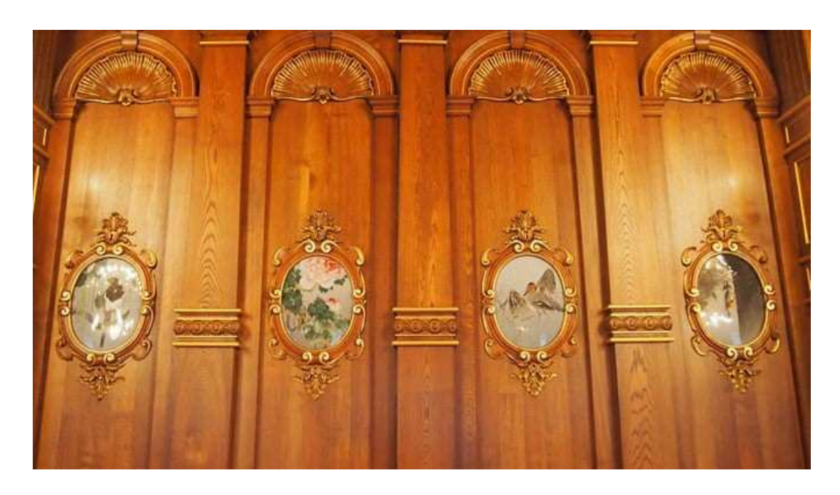
Figure 6. Namikawa Sōsuke, after Watanabe Seitei, Cloisonné Medallions of Flowers and Birds, 1906-7, in Kachō no ma, Akasaka Palace, Tokyo.