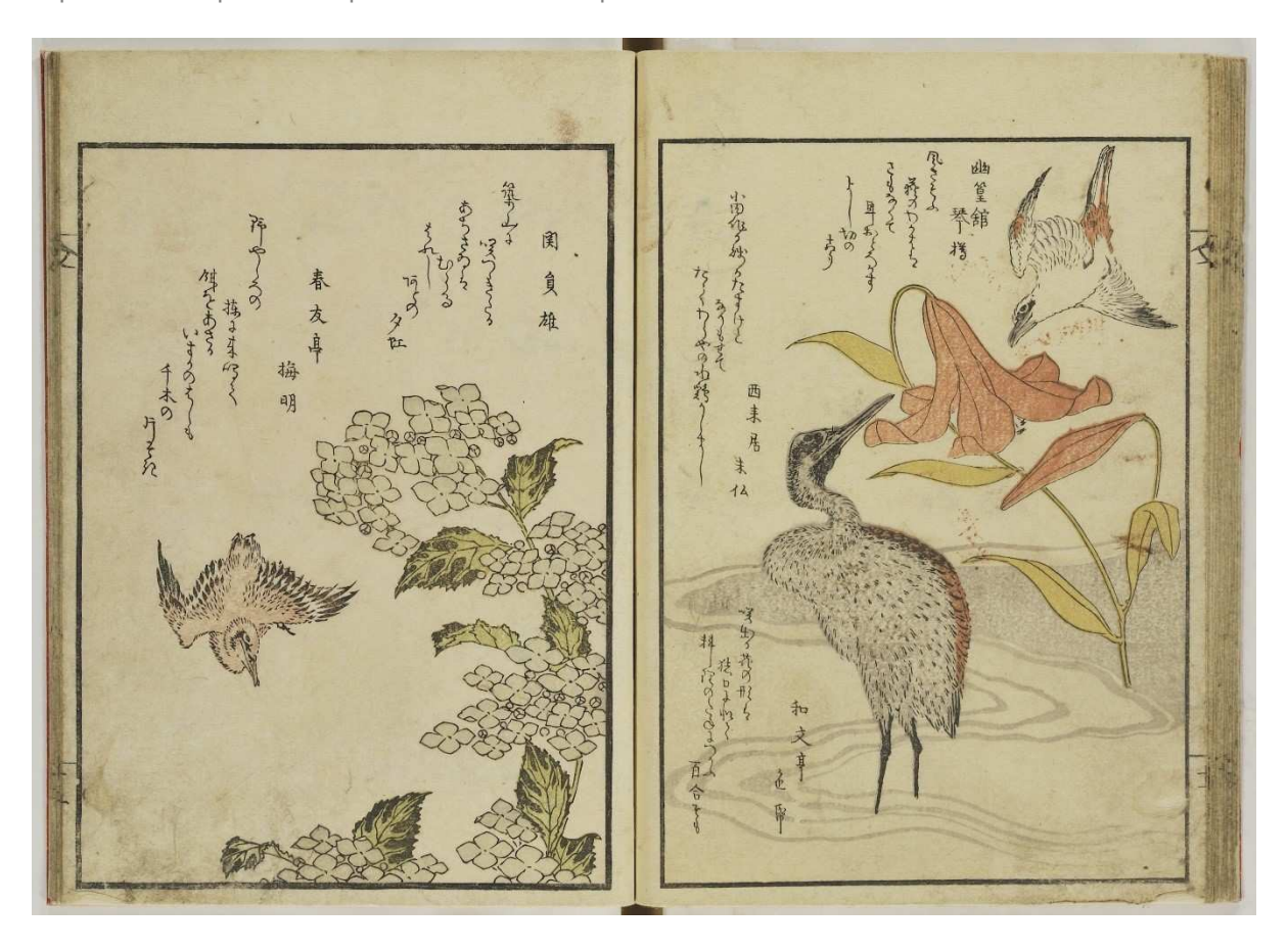
Figure 3. Totoya Hokkei, Hokkei Kachō Zue: Kyōka Hyakkachō (Hokkei's Guide to Birds and Flowers: One-Hundred Birds and Flowers with Kyoka Poems), 1826, woodblock-printed book, 20 x 15 cm.

Japanese woodblock prints also featured similar types of compositions that predominantly portrayed birds and flowers. Those prints, including book illustrations, showcased the development and increasing popularity of birds and flowers as subject matter significantly. Since the mid-Edo period the subject of flowers and birds became forming an independent genre, while, in earlier periods, those prints often combined visual images with literature (especially poetry), with encyclopaedic interests in natural history or served practical purposes as studies and models for later painters who wanted to learn drawing and motifs.