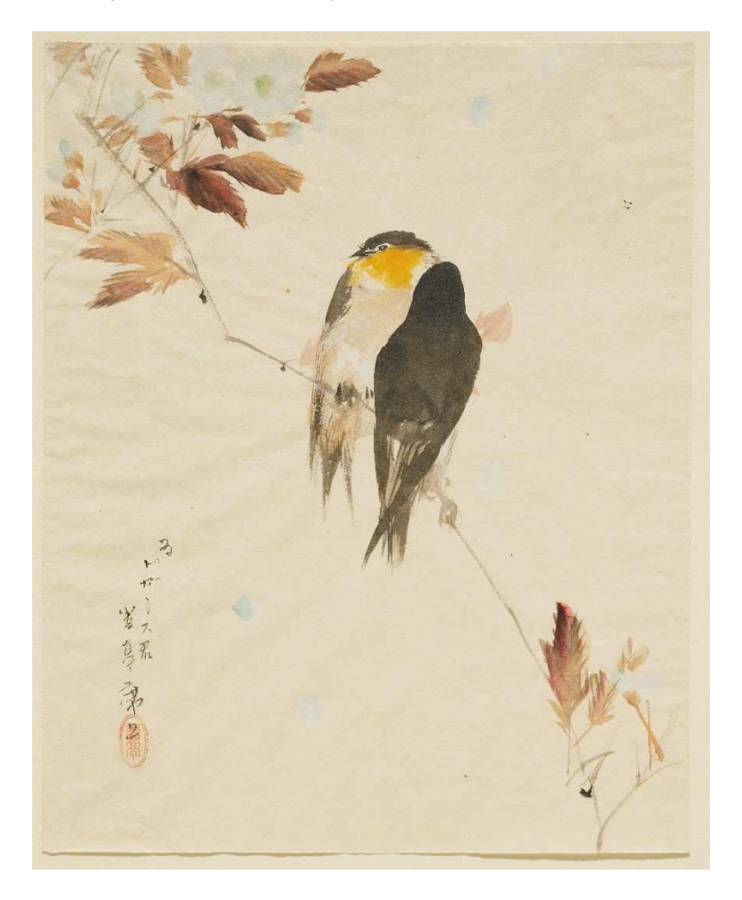
Figure 2. Watanabe Seitei, Birds on a Branch , watercolour on paper, 24.4 x 19.4 cm, Clark Art Institute, Williamstown, MA.

realism; therefore, he did not have autonomy and does not seem to have been involved in more progressive circles such as that of the Impressionists.<sup>15</sup>