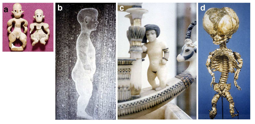
Fig. 1 Skeletal dysplasias through the ages. a Figures of male ( left ) and female ( right ) dwarfs from Egypt were made from hippopotamus ivory from the Predynastic Naqada II Period (3500–3200 BCE). b Granite stela of the dwarf Djheo from the Late Period (750–332 BCE). Short stature was not regarded as a physical deformity but as a divine mark, therefore dwarfs wanted their likeness to be depicted on their stele. Djheo (a native

in equal measures, as do G and C, and this led to the description of the double helix shape of DNA [3]. Following the discovery of chromosomal changes in the early 1960s [4], medical genetics experienced rapid expansion.