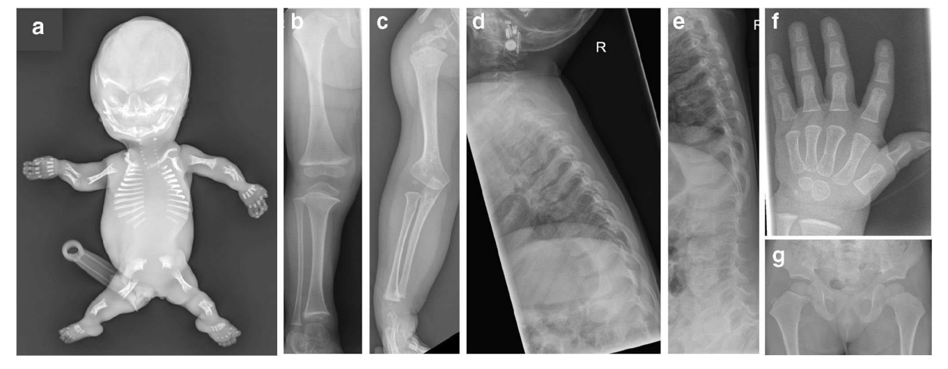
Fig. 2 The range of Type 2 collagen disorders spans from lethal achondrogenesis type 2 ( a ) to the relatively mild Stickler syndrome ( b - g ), in which final height may be within normal limits. a Anteroposterior (AP) radiograph of a 17 gestational-week fetus shows typical features of achondrogenesis type 2. b - g 3-year-old boy with Stickler syndrome. AP radiograph of the right lower extremity ( b ) shows wide metaphyses of the lower lmb. AP radiograph of the right upper extremity ( c ) shows wide

During the 1980s, there was the wide recognition of families of disorders. These families have certain characteristics in common and are the result of different mutations in the same gene. One example is the Type 2 collagen family ranging from lethal achondrogenesis Type 2 through spondyloepiphyseal dysplasia congenita to the milder Stickler syndrome (Fig. 2).