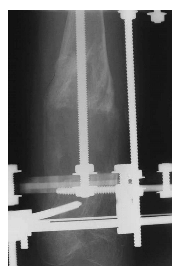
Fig. 2 Radiograph of deformity correction of tibia using external fixation

Baumgart et al. [13] identified complications when using external fixation. Typically, bone in Ollier's disease is relatively soft, so external fixator pins may cut out resulting in the premature removal of the fixator. Watanabe et al. [14] identified bone weakness in their patients with Ollier's disease. They adapted their procedures that included