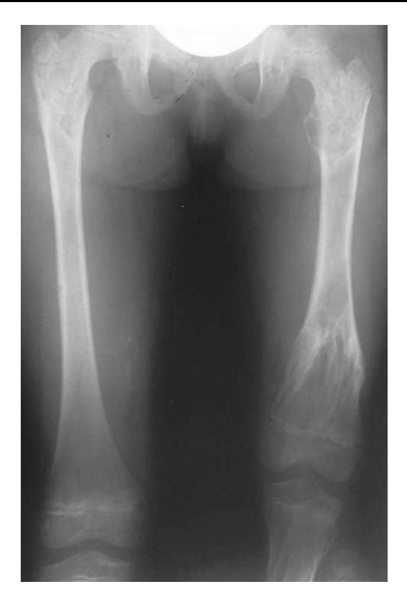
Fig. 1 Radiograph showing left femur enchondroma in a child with Ollier's disease

total of 14 patients had this deformity. Märtson et al. [11] described a case of varus deformity in the femur and valgus deformity in the tibia. The femur was lengthened by 22 cm, and the tibia by 10 cm. No complications were reported. There were five cases of genu varum and six of genu valgum in our group of patients.