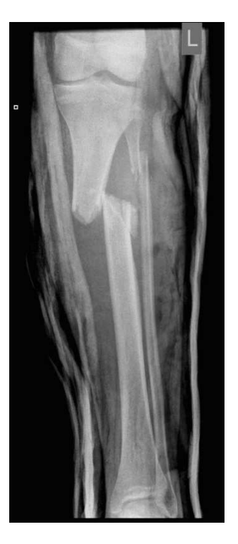
Fig. 4 Preoperative radiograph of an unstable proximal 1/3 tibial fracture % \left[ {{\left[ {{{\rm{T}}_{\rm{T}}} \right]}_{\rm{T}}} \right]_{\rm{T}}} \right]