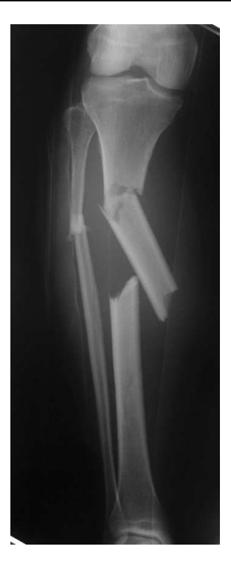
Fig. 1 Preoperative radiograph of a segmental tibial fracture