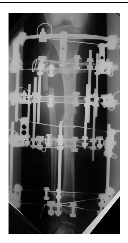
Fig. 2 Taken during treatment once the Ilizarov frame had been attached

The surgical technique was similar for both types of fixators. Surgery was performed in a laminar airflow theatre, which was our unit's standard operating theatre used for such cases. All patients received antibiotic prophylaxis at induction of anaesthesia. Tourniquets were not used.