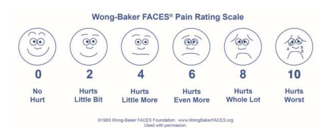
Figure 1: Wong-Baker FACES® Pain Rating Scale