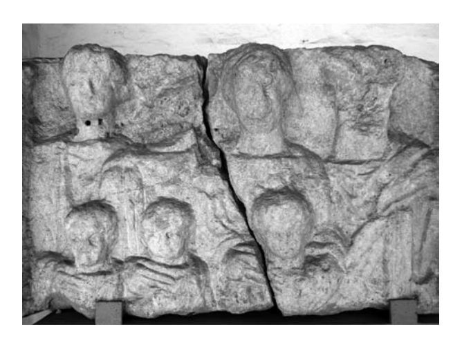
Fig. 5. Gravestone of a large family in Aquincum, early 3^{rd} c.

Even families who were not indigenous to the area adopted the custom of displaying an extended family with more than one child, making use of local sculptors who were adept at carving such scenes. Syrian troops of the cohors miliaria Hemesenorum stationed at Intercisa from the late 2<sup>nd</sup> – mid-3<sup>rd</sup> c. belong to those incoming groups who adopted indigenous Danubian commemorative formulae in format and content (Fitz 1972; Mócsy 1974, 227-230). This unit did not recruit locally, but was replenished repeatedly with troops from the province in which it was raised, almost certainly because these soldiers were archers not readily available elsewhere (Cheesman 1914). Germanius Valens, a soldier in