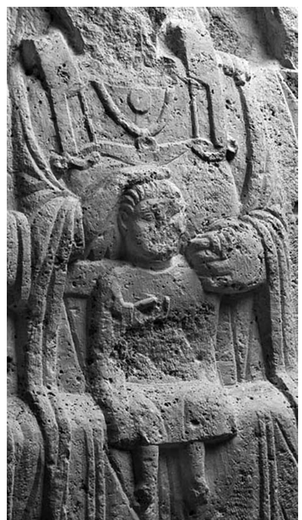
Fig. 4. Grave stele of an indigenous family from Intercisa , late 2<sup>nd</sup>/early 3<sup>rd</sup> c. Detail of one of the women with her child.

The popularity of family scenes with children amongst the indigenous population had a profound impact also on military families, especially after soldier marriages were recognised under Septimius Severus and recruitment in the army involved tapping into increasingly sedentary military families for fresh manpower. Soldiers often