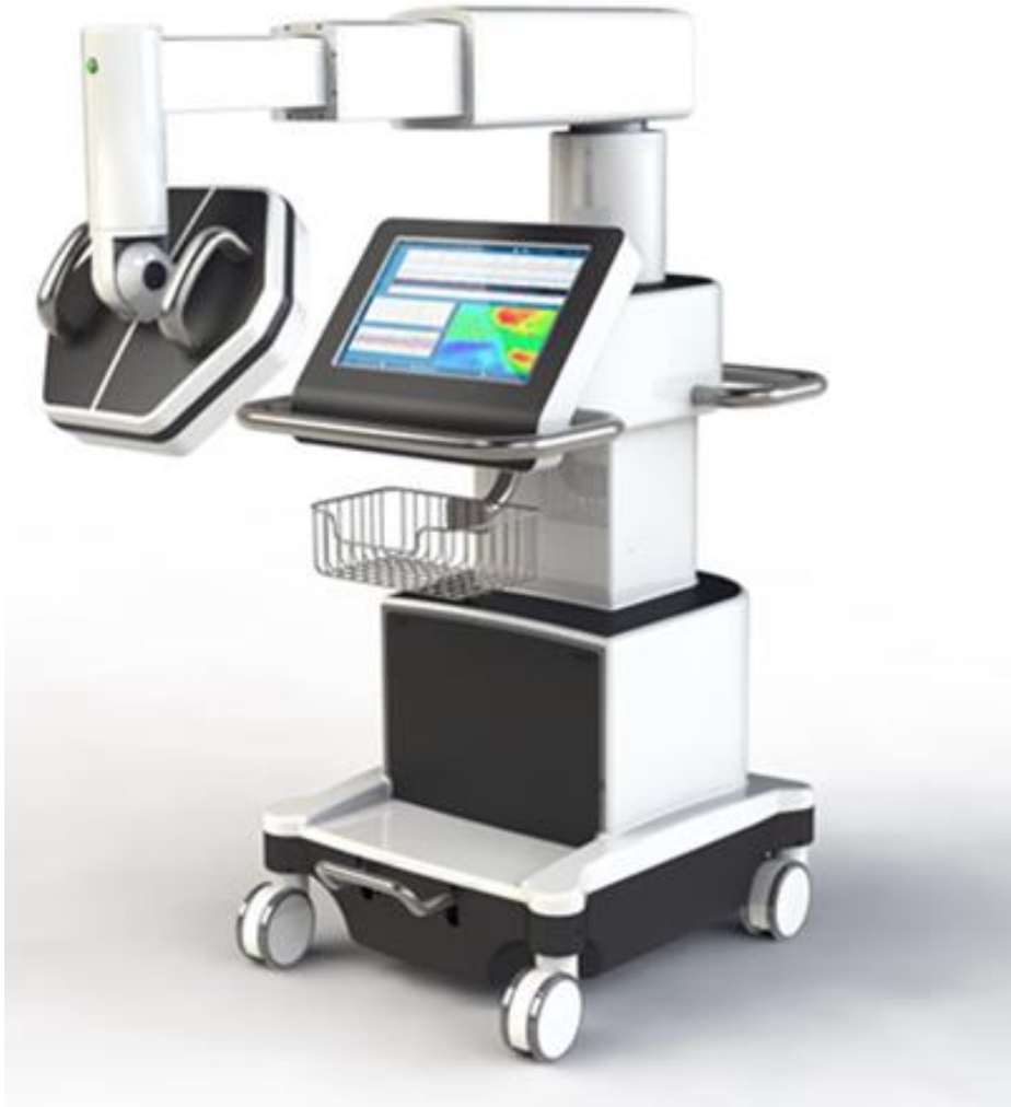
Figure1: The VitalScan Magnetocardiograph