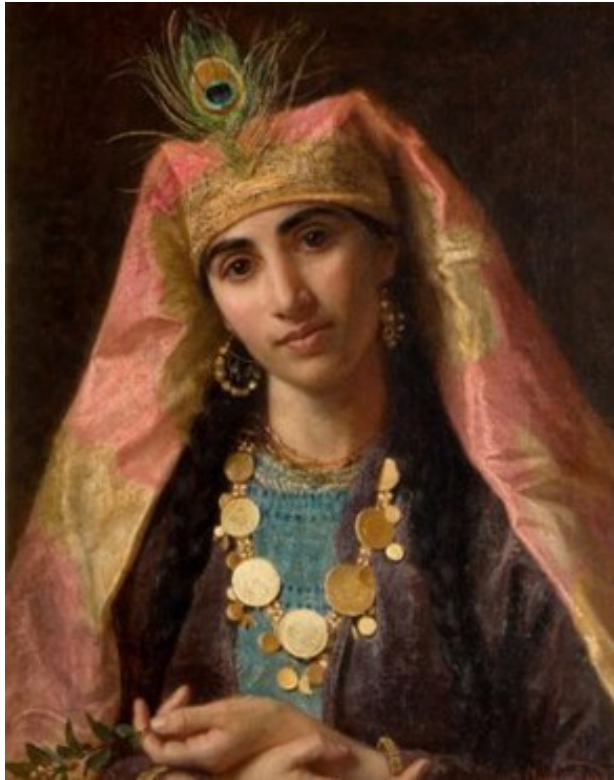
Figure 1. Sophie Anderson, Scheherazade , n.d., Oil on canvas, 50 x 41 cm.