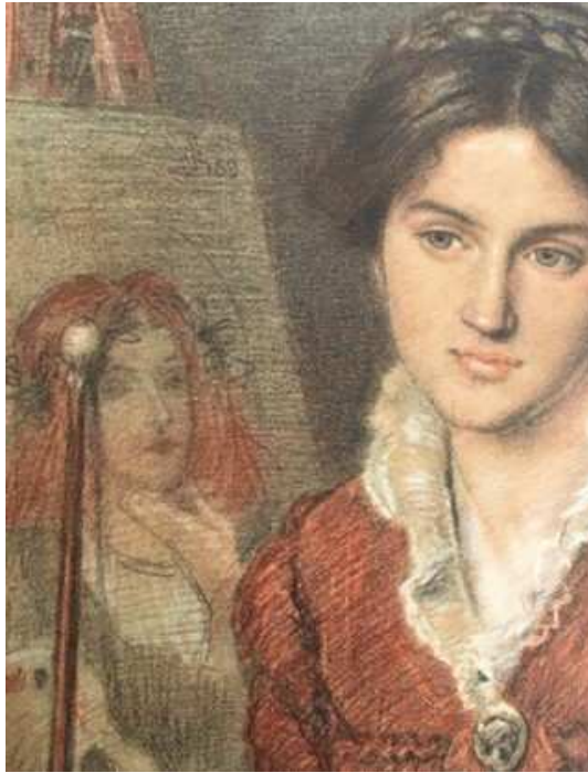
Figure 3. Detail, Ford Madox Brown, Portrait of Marie Spartali Stillman , 1869. Coloured chalks on paper, 775 x 559 mm. Private collection. Low-resolution detail photograph of out-of-copyright artwork used under fair dealing for critique or review.