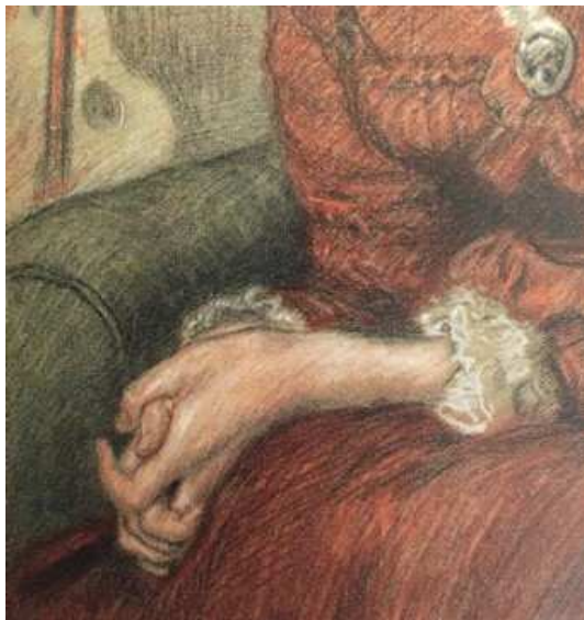
Figure 4. Detail, Ford Madox Brown, Portrait of Marie Spartali Stillman , 1866/7. Chalk on paper, DIM. Private collection. Low-resolution detail photograph of out-of-copyright artwork used under fair dealing for critique or review.