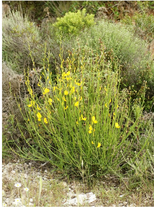
Figure 2. Spanish broom near Perasdefogu, Sardinia, Italy. © Hans Hillewaert, 2008. Licensed under CC BY-SA 3.0.

Apollo and the crowns given to victors in poetic competitions. These symbolic interplays reinforce the character of the Lady Prayse-Desire from Spenser's poem. The Lady Prayse-Desire tells the Prince, 'Pensive, I yeeld [sic] I am, and sad in mind, / Through great desire of glory and of fame'; another figure gives the Prince her name: 'her name was Prayse-desire, / That by well doing sought to honour to aspyre'. 7 Spartali Stillman's painting is a pictorial and textual claim to Athena's protection and Apollo's glories.