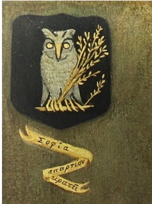
Figure 1. Detail, Marie Spartali Stillman, The Lady Prays-Desire , 1867. Watercolour with gold paint on paper, 419 x 305 mm. Private collection. Low-resolution detail photograph of out-of-copyright artwork used under fair dealing for critique or review.

“spartíon””. By combining this translation with the iconographic content of the cartouche— an owl holding some kind of branch— with a bit of judicious Googling, we found that 'spartíon', or Spartium , is the Latin name for Spanish broom, a leafy shrub with bright golden flowers that is clearly identifiable as the plant held by the owl (Fig. 2). With the pun on Spartali , it becomes clear that the cartouche and motto go beyond merely ‘invok[ing] Spartali Stillman’s Greek heritage’. 5 Rather, she directly places herself in the grasp of Wisdom, and Athena, who was not only the goddess of wisdom and war, but also artistry and crafts. On a painting described as ‘personifying not beauty but ambition’, and an allegorical figure who ‘aspires to honour’, through the character of Lady Prayse-Desire from Edmund Spenser’s The Faerie Queene , the symbolism of the artist textually and visually placing herself in the grasp of Athena on the picture plane is clearly directly relevant to the content of the picture. 6