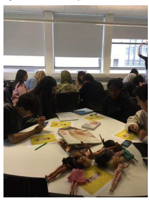
Figure 6: Students in 'Unpack Barbie' session