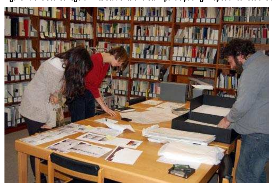
Figure 7: Chelsea College of Arts students and staff participating in special collections session

The total attendance for the first year of the new workshops was 61%, a significant improvement on previous year's figures, with 100% students finding the workshop "useful" or "very useful". The programme of workshops has been another success in the Library Services approach to delivering information literacy training and will continue to be refined and further developed in respect of the feedback received and will aim to increase attendance and the perception of usefulness and relevance of such training.