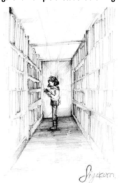
Figure 4: Example of student drawing