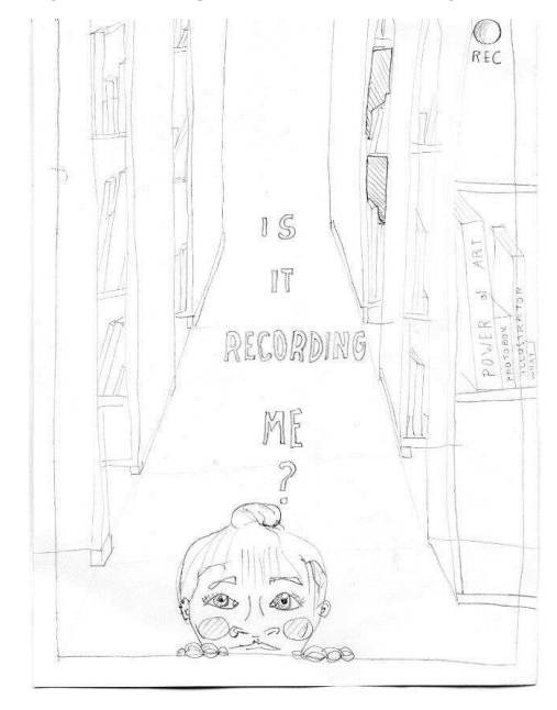
Figure 2: Example of student drawing