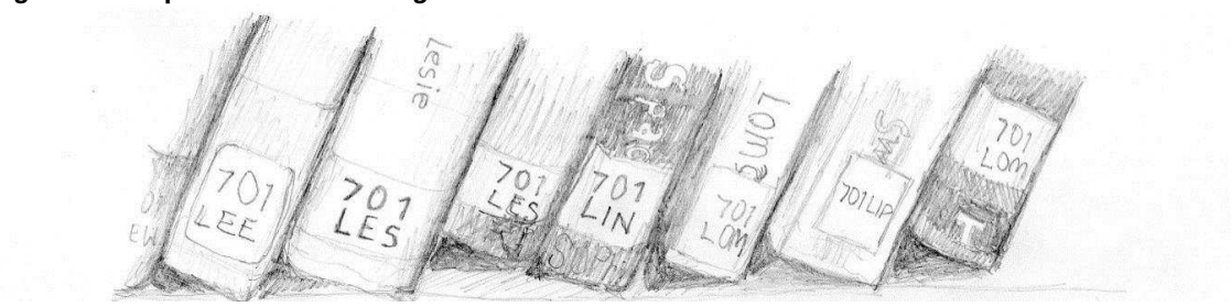
Figure 1: Example of student drawing

As a result of engaging the Foundation students through this creative approach to introducing them to the library, the students are making increased use of the facilities and resources available to them throughout their short year long course.