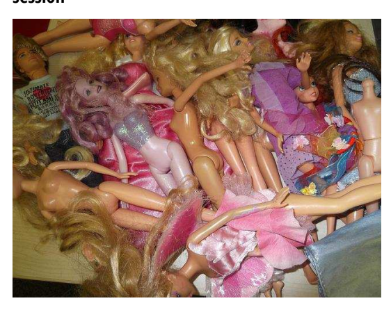
Figure 5: Examples of objects in 'Unpack Barbie' session

opportunity and a safe learning environment in which students can develop the critical thinking, questioning and visual literacy skills which are the intended outcomes of the session. This example of object-based learning in practice is a good example of 'reflection in practice,' as identified by Schön (1983) where students reflect, evaluate and take action through making decisions during the object handling activity. 'Unpacking Barbie' has been successful for the LCF Library and Academic Support teams and is now in its third year. Feedback suggests that, as a result of taking part in the workshop, students feel that they have acquired new research skills and talk fondly of the experience and how they have used the library and will continue to do so throughout their studies.