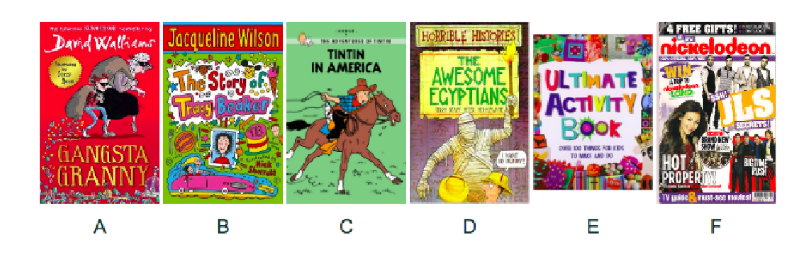
8. If you could choose three things to read for fun from the list above, which would they be?