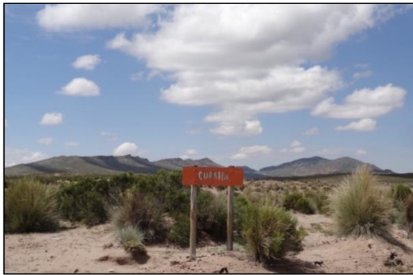
Old signboard of the “Cuprita” copper mine.

mines have been absorbed, and expanded with “Cuprita II”, an open pit project in the hands of the Bolivian company D’Cobre S.A. D’Cobre belongs to the Chinese company Chihong Zinc & Ge, which is part of the Yunnan Metallurgical Group Co. Ltd. During our visit to the mine’s processing plant, a Chinese banner at the site proudly stated that Yunnan Metallurgical Group represented a “green and low-carbon industry” and labelled Chihong as a pioneer in “circular economy pilot enterprises in China.” 7