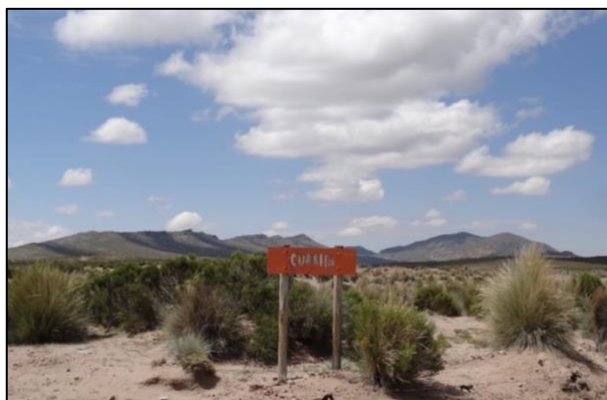
Old signboard of the “Cuprita” copper mine.

mines have been absorbed, and expanded with “Cuprita II”, an open pit project in the hands of the Bolivian company D’Cobre S.A. D’Cobre belongs to the Chinese company Chihong Zinc & Ge, which is part of the Yunnan Metallurgical Group Co. Ltd. During our visit to the mine’s processing plant, a Chinese banner at the site proudly stated that Yunnan Metallurgical Group represented a “green and low-carbon industry” and labelled Chihong as a pioneer in “circular economy pilot enterprises in China.” 7