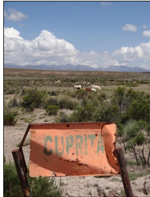
Llamas grazing behind the old signboard of the “Cuprita” copper mine.

mining is re-appropriating marginal and abandoned frontier spaces.