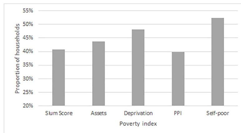
Fig 2. Proportion of the consumption poor identified using each poverty index.

index four groups are defined as households that are: 1) non-poor under both measures; 2) poor using deprivation, non-poor using consumption; 3) consumption poor, deprivation non-poor; and 4) poor under both measures. Groups 1 and 4 might be described as unambiguously non-poor or poor and more than 80% of households in our sample fall into one of these groups (71% non-poor, 9% poor).