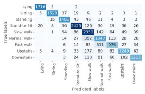
Figure 4: Confusion matrix of S/S group for tasks of activity

This problem was of lower concern here, in which quantity of each of activity was similar. Reporting the accuracy also allowed direct comparison to other work, and exact classifications are shown in table 2.