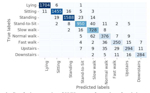
Figure 3: Confusion matrix of H/H group for tasks of activity

One potential limitation is that we have reported accuracies as our overall performance metric. It is well known that accuracy can be a poor metric of overall performance in the presence of unbalanced data.