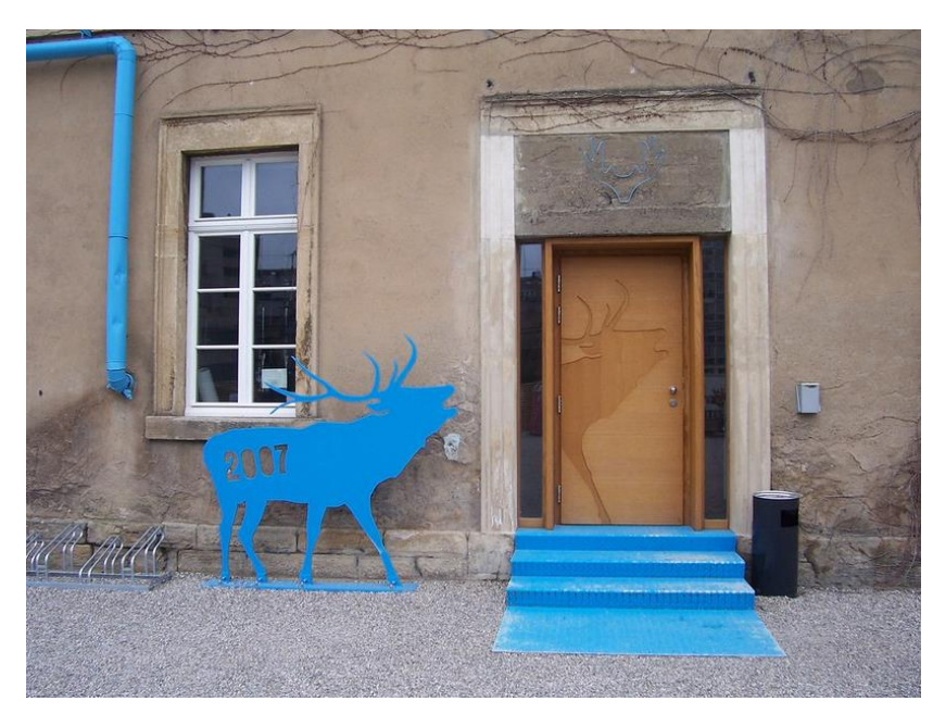
Figure 4. Steel cutout of the Luxembourg 2007 logo by the city's European Capital of Culture headquarters.

At the same time, in an interview I conducted with the communications manager for Luxembourg 2007, she said: "Rebuilding the image of Luxembourg is at the very core of Luxembourg 2007: from outside, Luxembourg is mostly seen as 'banks,' so we want to make something new and reactivate creativity." As a country with one of the largest GDPs per capita in the world, Luxembourg had a budget of \notin 7,000,000 for communication related to the European Capital of Culture alone, and focused on spreading its brand image across the city. For this reason, a plethora of steel cutouts of the whimsical Luxembourg 2007 logo, a blue deer, were strategically placed by major city buildings, in addition to the European Capital of Culture headquarters (Figure 4). The blue deer were sponsored by ArcelorMittal, the world's largest steel company with headquarters in Luxembourg, which was one of the major partners of Luxembourg 2007. In Luxembourg, the hyperbranding extended to street lighting and the 54 types of different branded products that were developed for Luxembourg 2007, with two new products being introduced every month based on the time of the year like, for example, gloves for the winter, and flip-flops for the summer.