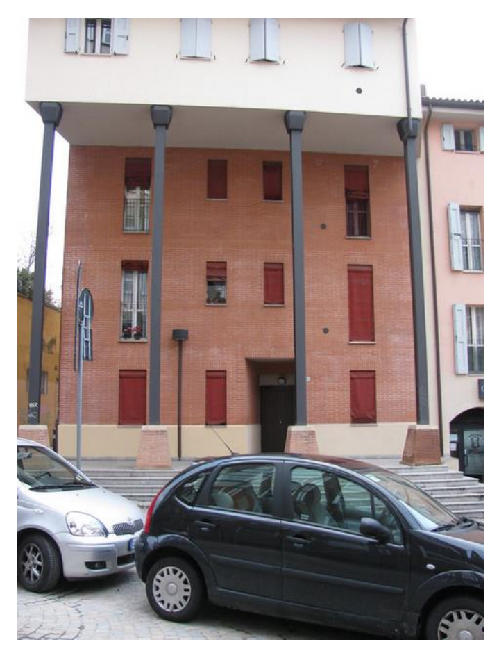
Figure 6. Layering of contemporary and historic architectural details in Bologna's Manifattura delle Arti student housing.

Another example of this kind of layering can be observed in the former slaughterhouse's outdoor space (Figure 7). Here, public seating made of dark teak on a brushed metal structure is set against the background of an historic building, featuring a red brick wall with yellow plaster trims and arched windows. This arrangement is made even more deliberate by the symmetrical framing of the three pieces of public furniture against the two original windows. The resulting effect of juxtaposition is striking and distinctive, but also familiar and generic. It is through such juxtaposition of stylistic references that Manifattura delle Arti is made to "look like" historic Bologna, while also performing a cosmopolitan identity. Reconverted districts like this mobilize semiotic resources that balance local and global identity traits. In doing so, they maximize on the symbolic profitability of distinction—from the surrounding neighbourhood, from the rest of the city, and from other cities—within prized formats of urban design.