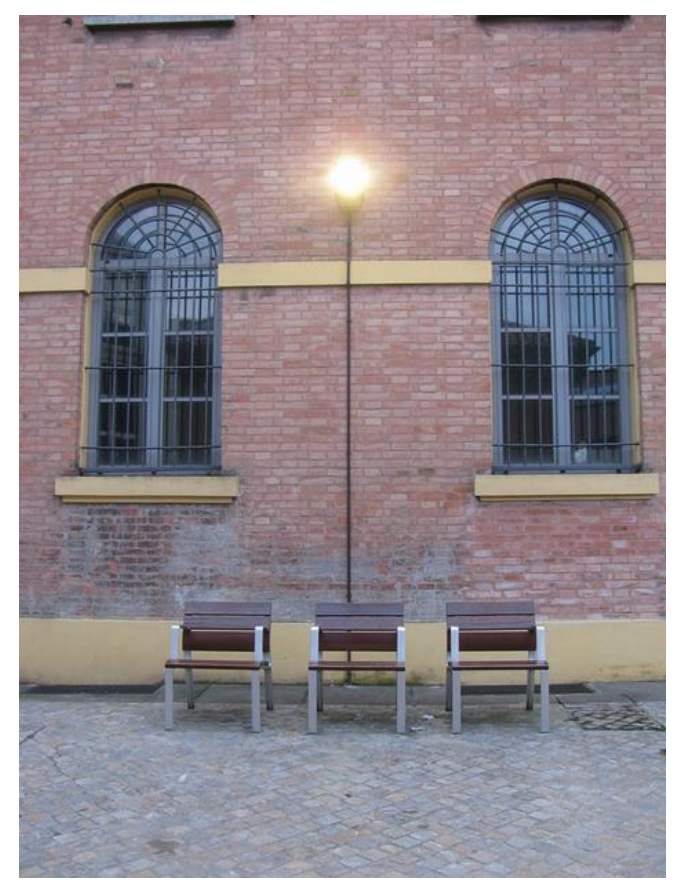
Figure 7. Juxtaposition of "historic" and "cosmopolitan" details in outdoor space by Manifattura delle Arti's former slaughterhouse.