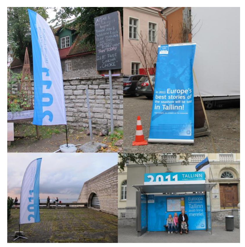
Figure 5. Moveable banners and structures with Tallinn 2011 branding.

This aestheticized signposting of private development in both cities tells us something about the importance of each European capital of culture as a temporary performative stage for lasting corporate business. While the European Capital of Culture title comes with European Commission funding for the required yearlong cultural exchanges and activities, this is also a scheme that aims to "boost" local economies through urban regeneration plans to be fueled both by public and private investment. It is therefore also and foremost by paying attention to both cities' aesthetics that we can understand this problematic entrenchment of "light" cultural policy and "heavy" globalist capital.