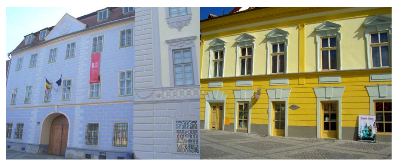
Figure 3. Renovated façades in Sibiu's historic center.

At the same time, in an interview I conducted with the communications manager for Luxembourg 2007, she said: "Rebuilding the image of Luxembourg is at the very core of Luxembourg 2007: from outside, Luxembourg is mostly seen as 'banks,' so we want to make something new and reactivate creativity." As a country with one of the largest GDPs per capita in the world, Luxembourg had a budget of \notin 7,000,000 for communication related to the European Capital of Culture alone, and focused on spreading its brand image across the city. For this reason, a plethora of steel cutouts of the whimsical Luxembourg 2007 logo, a blue deer, were strategically placed by major city buildings, in addition to the European Capital of Culture headquarters (Figure 4). The blue deer were sponsored by ArcelorMittal, the world's largest steel company with headquarters in Luxembourg, which was one of the major partners of Luxembourg 2007. In Luxembourg, the hyperbranding extended to street lighting and the 54 types of different branded products that were developed for Luxembourg 2007, with two new products being introduced every month based on the time of the year like, for example, gloves for the winter, and flip-flops for the summer.