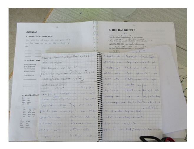
Figure 2 Tailor F's study material in Swedish

him to find his first clients, and spread the word about the new tailor in town. He achieved minor celebrity status for a Swedish-language newspaper profile article entitled "Äntligen for jag jobba. At last I can work." This was a way into the local community. Not only was he willing to stay in the area and to learn Swedish, but he worked hard for his living. He progressed in his trade: beginning with dress-making and alterations, he expanded into services for furniture and marine upholstery.