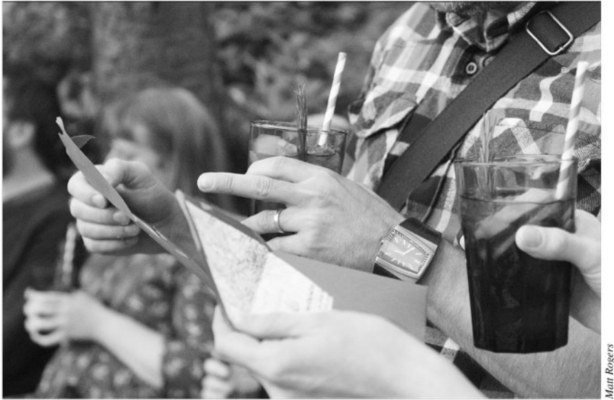
Fig. 9. Discovering map memories at the Dinner with Absent Friends.

questions of manufacture' to develop a 'rich sense of objects'. 42 On the Journey with Absent Friends the opportunities for imagination, interpretation and understanding were widened by the sensory experiences on offer. The domestic space of a caravan, filled with stories and objects of remembrance from ordinary people, helped visitors to connect with their own everyday experiences of grief. (Fig. 9)