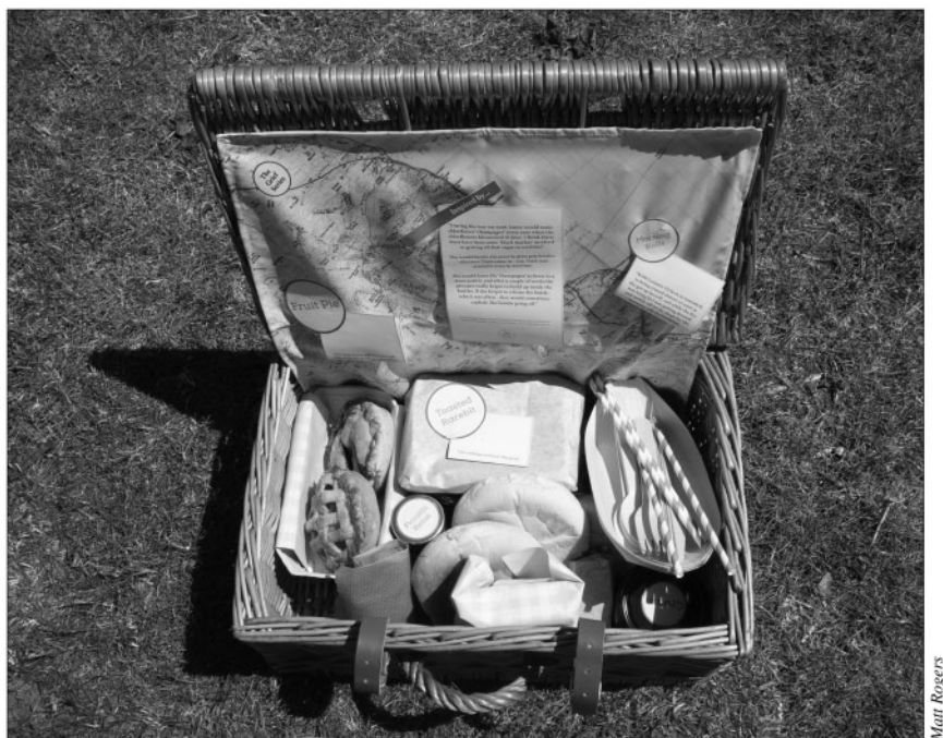
Fig. 7. The picnic hamper, featuring a range of food memories.