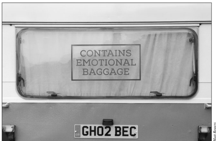
Fig. 8. Warning sign on the rear window of Perle the caravan.

Nevertheless, it was the difficulties which people reported in dealing with death that led Ellie to embark on the Grief Series a decade ago, and death, grief and bereavement can provoke difficult and sometimes overwhelming emotions. For this reason it was important to make the space feel open, non-judgemental and safe. A number of elements of the caravan helped visitors to engage with the topic of grief and share their own stories.