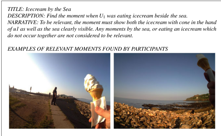
Fig. 13.3 LSAT Topic Example, including example results

used. Participants were allowed to undertake the LAST subtask in an interactive or automatic manner. For interactive submissions, a maximum of five minutes of search time was allowed per topic.