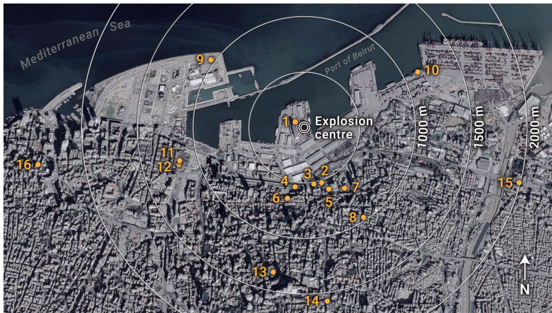
Fig. 1 Filming locations of the 16 videos [1–16] used to estimate the yield of the 2020 Beirut explosion. Satellite imagery from Google Earth (January 2020)