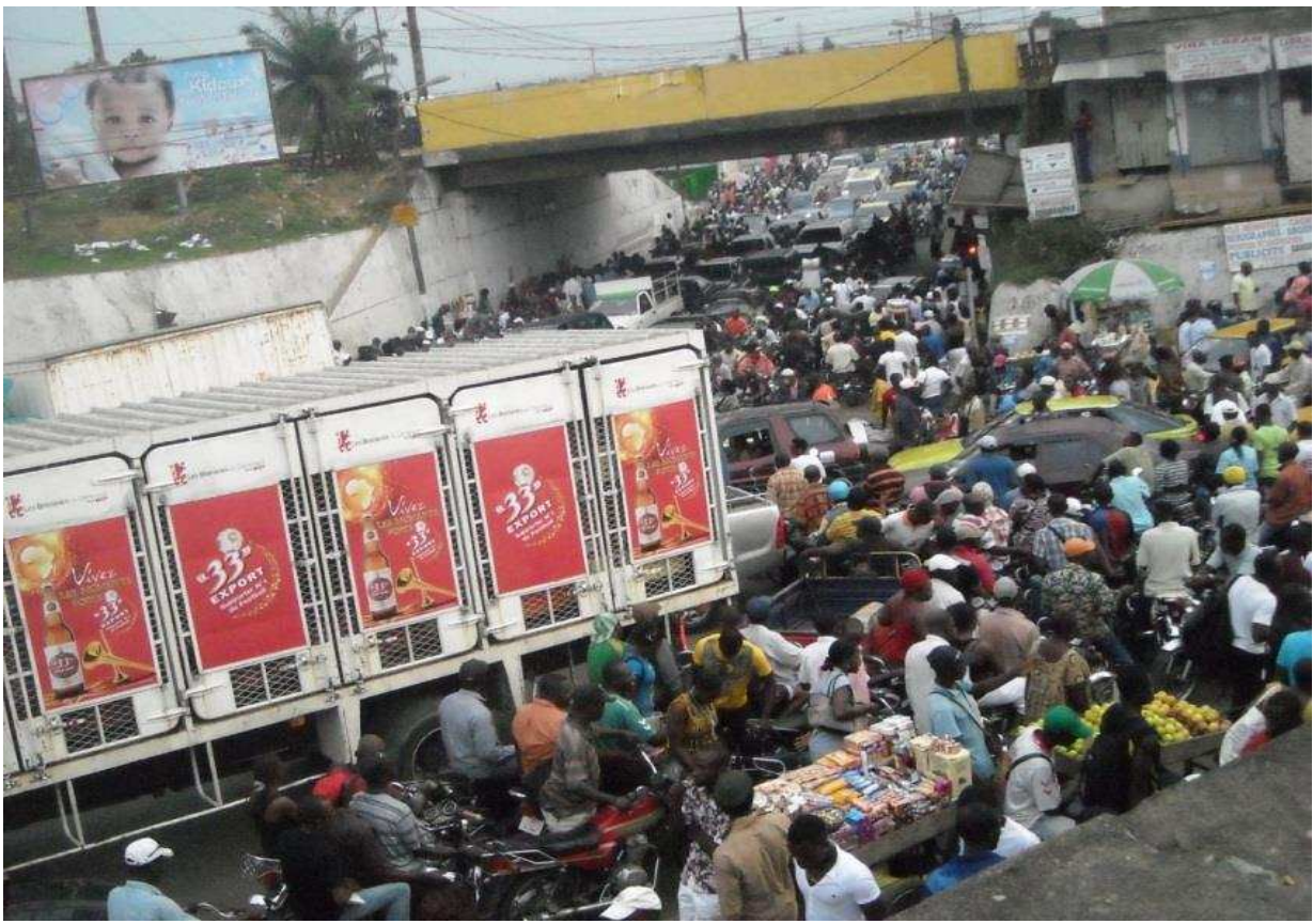
Figure 3 Traffic in the neighbourhood of Ndokoti, Douala (Sados, 2013).