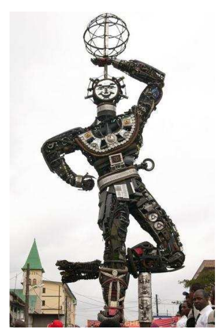
Figure 4 La nouvelle liberté, Joseph-Francis Sumegné

Monumental installations have been set up in the middle of traffic roundabouts (Fig. 4); murals or small-scale sculptures have been placed on passageways of informal settlements, architectural installations have been integrated near marginalised residential neighbourhoods. According to the citizens, public art has generated an impact on the urban transformations, contributing to improve the reputation of some districts, increasing economical activities, and encouraging the municipality to take care of places that otherwise would have remained isolated (including for example the wasting collection system around installations).