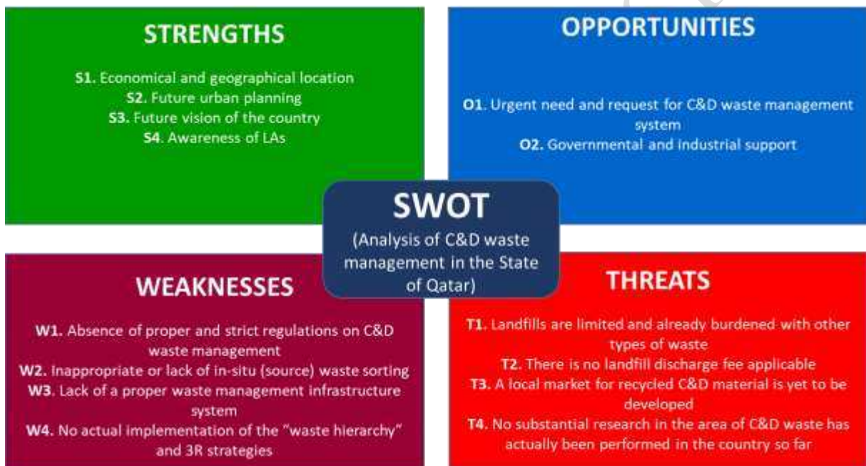
9 10 Fig. 1 SWOT analysis of C&D waste management in the State of Qatar.

1 four SWOT factors, in order to complete the relative matrix and develop the relevant 2 strategies. Strengths and weaknesses of the current C&D waste management practices in the 3 State of Qatar were considered as “internal factors”, whereas threats and opportunities both 4 locally as well as globally were considered as “external factors” (Halla, 2007; Kajanus et al., 5 2012). The matrix shown in Fig. 1 was also used to identify and formulate any potential 6 strategies that would most possibly improve the current state of C&D waste customs and 7 behaviours in Qatar.