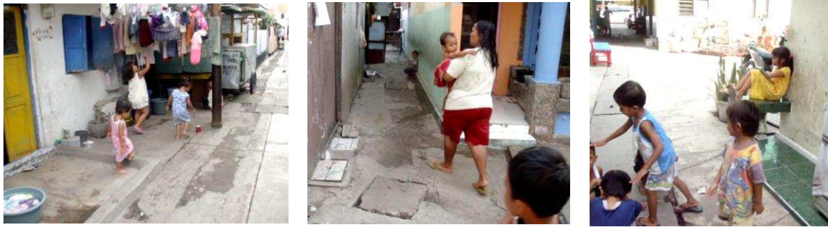
Figure 5. The kampungs' alley at one afternoon.

Around this time, most young adults have just woken up and are having their meals in the warung. They socialize with other kampung dwellers and some are accompanying their little brothers playing around the platform. Women socialize by sitting in front of their house while feeding, bathing their little children or preparing dinner. The mothers are talking to each other and watch their toddlers playing around. Then, the mothers continue combing the children's hair, powdering, and massaging eucalyptus oil on their tummy.