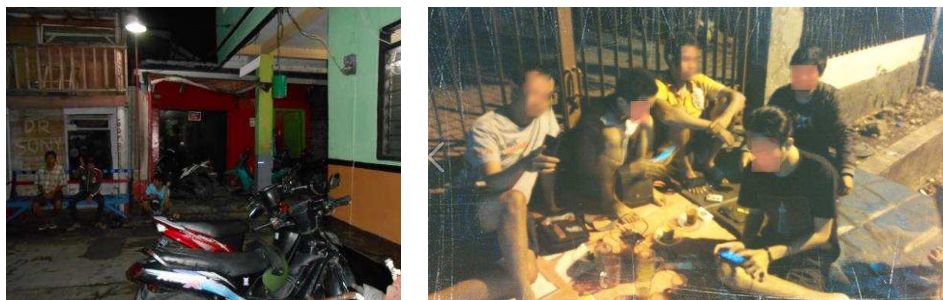
Figure 6. The kampungs' alley for party at one night.

Fewer people are in the alley. The location of socialization is slightly different for the afternoon activities. The kampung's alley is predominantly occupied by young male adults and men. They gather around the Mosque and the cyber café started from around 8 p.m. The café is open all day (24 h a day/7 d a week) and some customers come from outside the kampung. They are walk or ride their motorbike to the café. The motorbikes are parked in the open space near the Mosque; hence, when the men who are gathered in the open space finish their socializing and go to work (at the Keputran market), the space is full of the café's customers' motorbikes. At night, the kampung is relatively quiet; only the main alley has street lamps, all houses and warungs are closed except the cyber café and its warung. The only people who walk in the alley are the workers with their uniform who just finished their night shift.