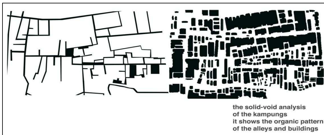
Figure 4. The solid and void analysis of the kampungs.

Through the contemporary perspective, the reading of kampungs is done by observing the social production of space that occurred in the kampungs. This research undertook two analysing methods: observing the daily rhythm of the kampungs and exploring the perception of the young adults of their kampungs.