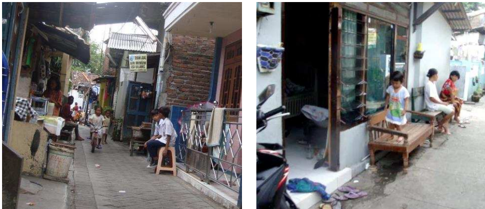
Figure 7. Social spots along the alley.

Another perception (that came up in the interviews): the kampung is perceived as nice place but it is also full of gossipers; peaceful place but traditional way of life. These respondents understood the changing meaning of space in the kampungs over the course of a day. The meanings are carried by the people and their activities. It is the detail that the respondents understood about the space. The physical condition of the kampungs (low, single and semi permanent houses) are seen as traditional characteristic compared to the modern building around them. The contrasting condition with the surrounding creates a feeling of 'thereness', a condition that also Cullen refers to.