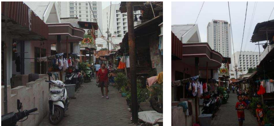
Figure 3. The kampung and the commercial areas as a background.