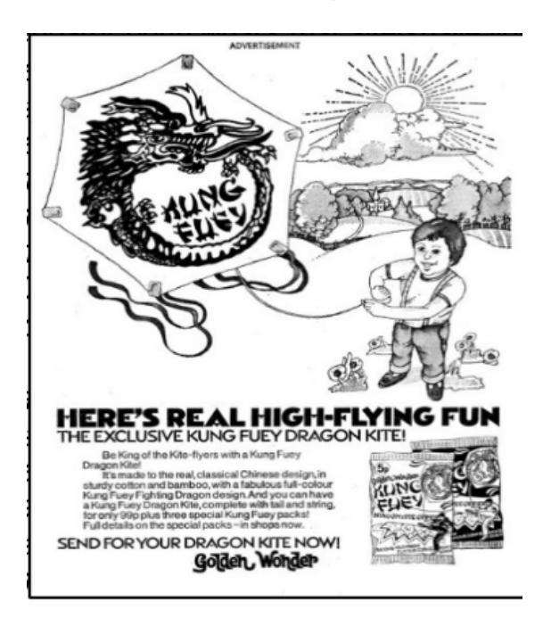
Here's Real High Flying Fun – the exclusive Kung Fuey Dragon Kite! (Action, Issue 35, 9th October 1976).