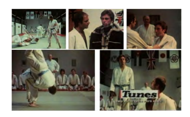
Storyboard: Wrigley's Tunes 'Judo' (1976)

End line: Help you breathe more easily, in cherry, honey and new blackcurrant favours