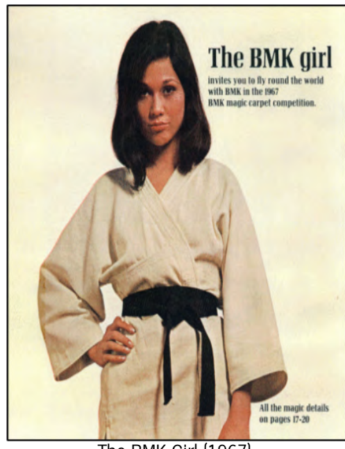
The BMK Girl (1967)

During 1967-1969, BMK carpets ran a series of print adverts by Ogilvy & Mather. These included 'The BMK Girl' (1967), 'Don't let the softness fool you' (1967), 'Soft yet tough as they come' (1969) and 'The soft carpet with the guiet strength' (1969):