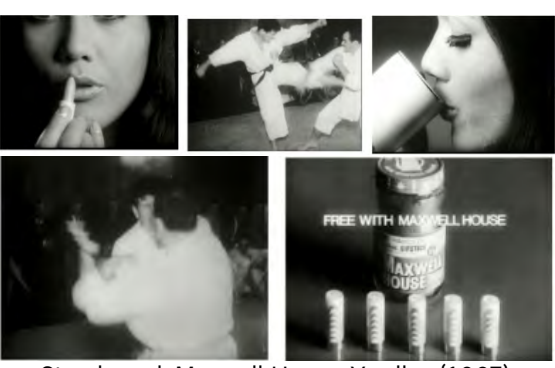
Storyboard: Maxwell House-Yardley (1967)

Along a similar vein to the 'BMK Girl', this black and white TV commercial also featured an attractive female in a martial arts themed advert. In this case, the commercial is promoting the offer of a free Yardley branded lipstick with the purchase of a Maxwell House instant coffee. It features the model applying lipstick whilst looking at the camera before drinking Maxwell House coffee from a mug. The final shot is of a jar of coffee and range of lipsticks with the endline 'free with Maxwell House'. The commercial is interspersed with scenes from a martial arts contest between two men in their gis.