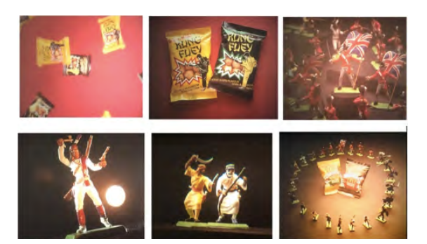
Storyboard: Golden Wonder's 'Warriors of the World' (1976)

The third advert no longer feature Annoyda Sensei. Instead focussing the commercial introduces Britains Deetail plastic soldiers. The commercial is accompanied by fanfare and sound effects (battle cries, bugle sounds, machine gun shots) as different toy soldiers appear on screen. This commercial is a departure from the norm and although some of the original content is the same as 'Something Special' (1974), the commercial noticeably changes tact half way through to showcase the promotion of Britains Deetail soldiers.