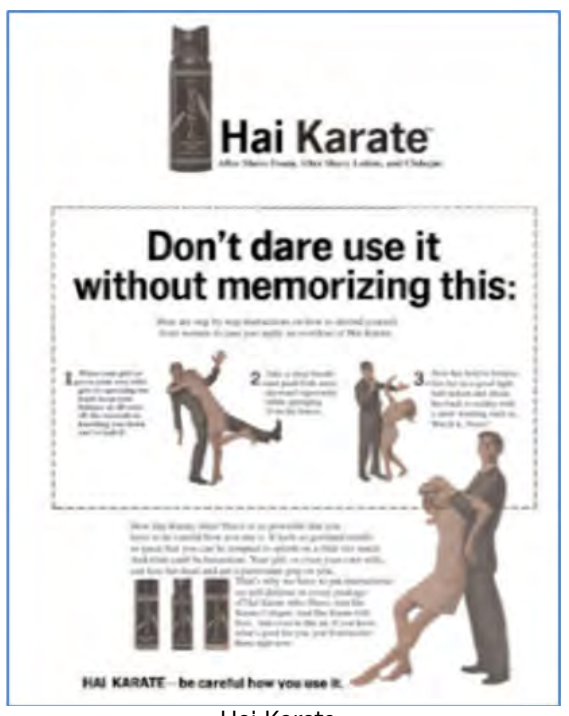
Hai Karate: Don't dare use it without memorizing this

Hai Karate's popularity was cemented by the humorous TV commercials that incorporated many of the clichés of aftershave advertising. This was supported with an Oriental themed brand concept of black packaging with Chinese effect typography that contained self-defence instructions to help the user defend himself from amorous women. The brand extension included variants beyond cologne and aftershave, namely: soap on a rope, shaving cream, talcum powder. As well as Regular, Hai karate lines included Oriental Lime (1968), Oriental Spice (1968) and Musk (1968) (Pollard, 2008).