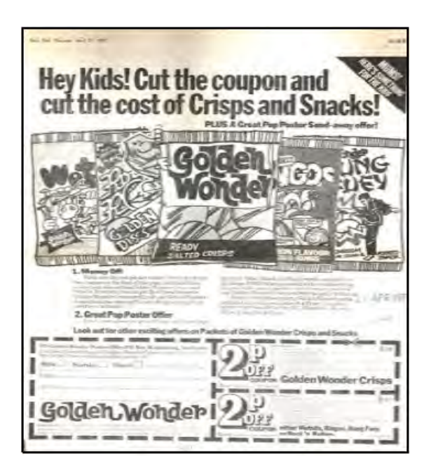
Hey Kids! Cut the coupon and cut the costs of crisps and snacks! (Daily Mail, 21st April 1977)