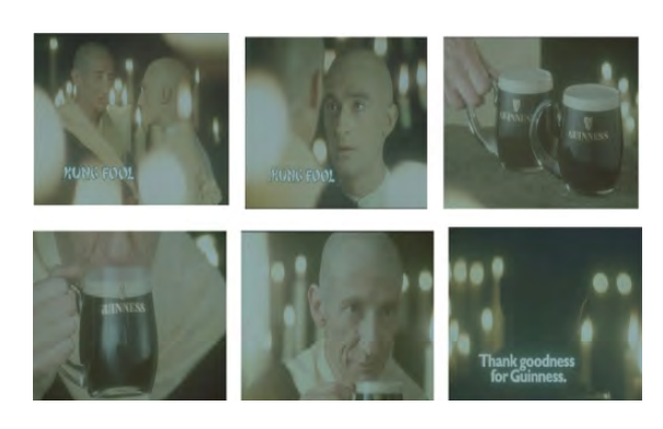
Storyboard: Guinness 'Kung Fool' (1977)

setting provide cues to its Japanese setting: shoji screens, low rectangular table, tatami mat flooring. The father and his number three son pays homage to the Charlie Chan films. By the late 1970s, increasing use of oriental actors in British TV commercials, albeit in stereotypical roles for the food grocery category was common place (see Bowman's article in this issue). This commercial is no different with its emphasis on 'Japanese' accents, the use of the word 'inscrutable', and reference to 'mysterious customs'. The link to martial arts is seen by the father's quest to teach his son to 'master the art 'of eating sausages using a fork and the son's attempt to exert some force before attempting to stab the sausage. The son also exclaims 'ah so!' This commercial may also have exacerbated the imitation of the derogatory term 'ah so!' by British schoolchildren in the playgrounds, along with the slant-eye or 'slitty eye' gestures in the 1970s.