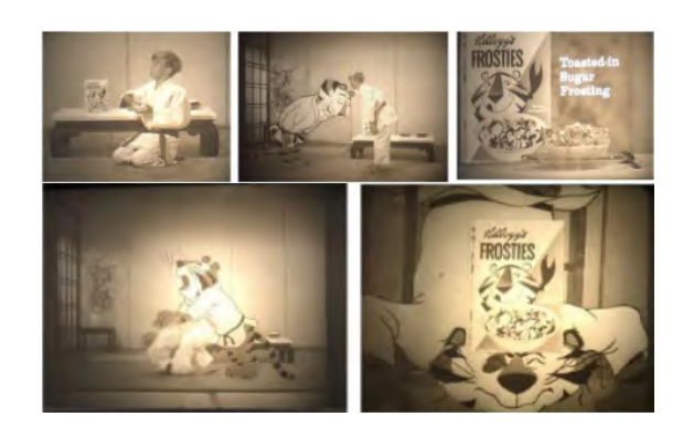
Storyboard: Kellogg's Frosties 'Judo' (1966)