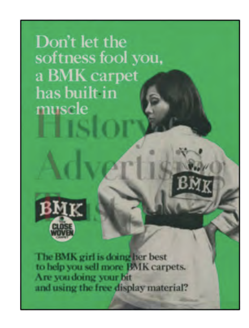
Don't let the softness fool you (1967):

Copy: Don't let the softness fool you, a BMK carpet has built in muscle. (BMK the close woven company). The BMK Girl is doing her best to help you sell more BMK carpets. Are you doing your bit and using the free display material?