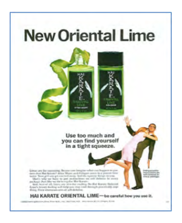
New Oriental Lime Use too much and you can find yourself in a tight squeeze

Hai Karate's popularity was cemented by the humorous TV commercials that incorporated many of the clichés of aftershave advertising. This was supported with an Oriental themed brand concept of black packaging with Chinese effect typography that contained self-defence instructions to help the user defend himself from amorous women. The brand extension included variants beyond cologne and aftershave, namely: soap on a rope, shaving cream, talcum powder. As well as Regular, Hai karate lines included Oriental Lime (1968), Oriental Spice (1968) and Musk (1968) (Pollard, 2008).