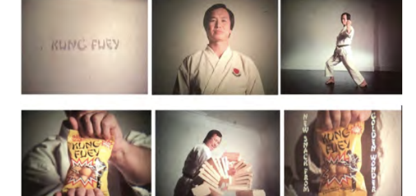
Storyboard: Golden Wonder's Kung Fuey (1974)

VO: Kung Fuey. From out of the East, comes a taste of a new way of life...Kung Fuey. Kung Fuey in bacon and mushroom flavour. Crisp, crunchy. Kung Fuey – the smashing new snack from Golden Wonder