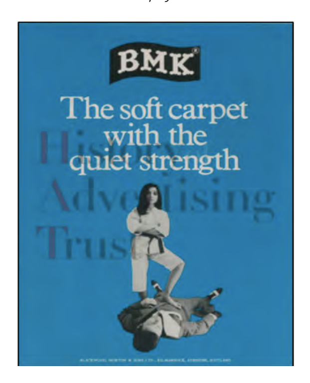
The soft carpet with the quiet strength (1969)

Soft yet tough as they come (1969): Copy: Soft yet tough as they come. Last year was the best ever for BMK carpet sales. This year we're promoting even harder, spending more money than ever before. Cash in on this by using the free display material.