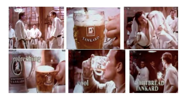
Whitbread Tankard Judo (1971)

Whitbread's Tankard was one of the key players in keg bitter in the market for British beers. It appealed to younger drinkers who would pay more for a premium brand. Advertising in the 1970s promoted keg over cask bitters as the former was more expensive. Keg bitter's popularity was eventually overtaken by lager (Redman, nd).<sup>3</sup>