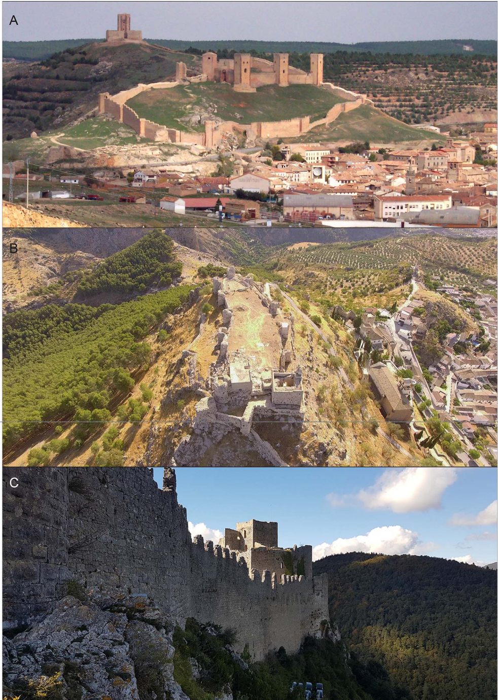
Figure 2. The castles that functioned as centres and symbols of frontier authority: A) Molina de Aragón (Guadalajara) ( https://es.wikipedia.org/wiki/Real_Sc&per;C3&per;B1o&per;C3&per;ADo_de_Molina&hash;/medialArchivo:Molina_de_Aragon2.jpg ); B) Moclín (Granada); C) Puilaurens (Occitanie) (B–C by Aleks Pluskowski).