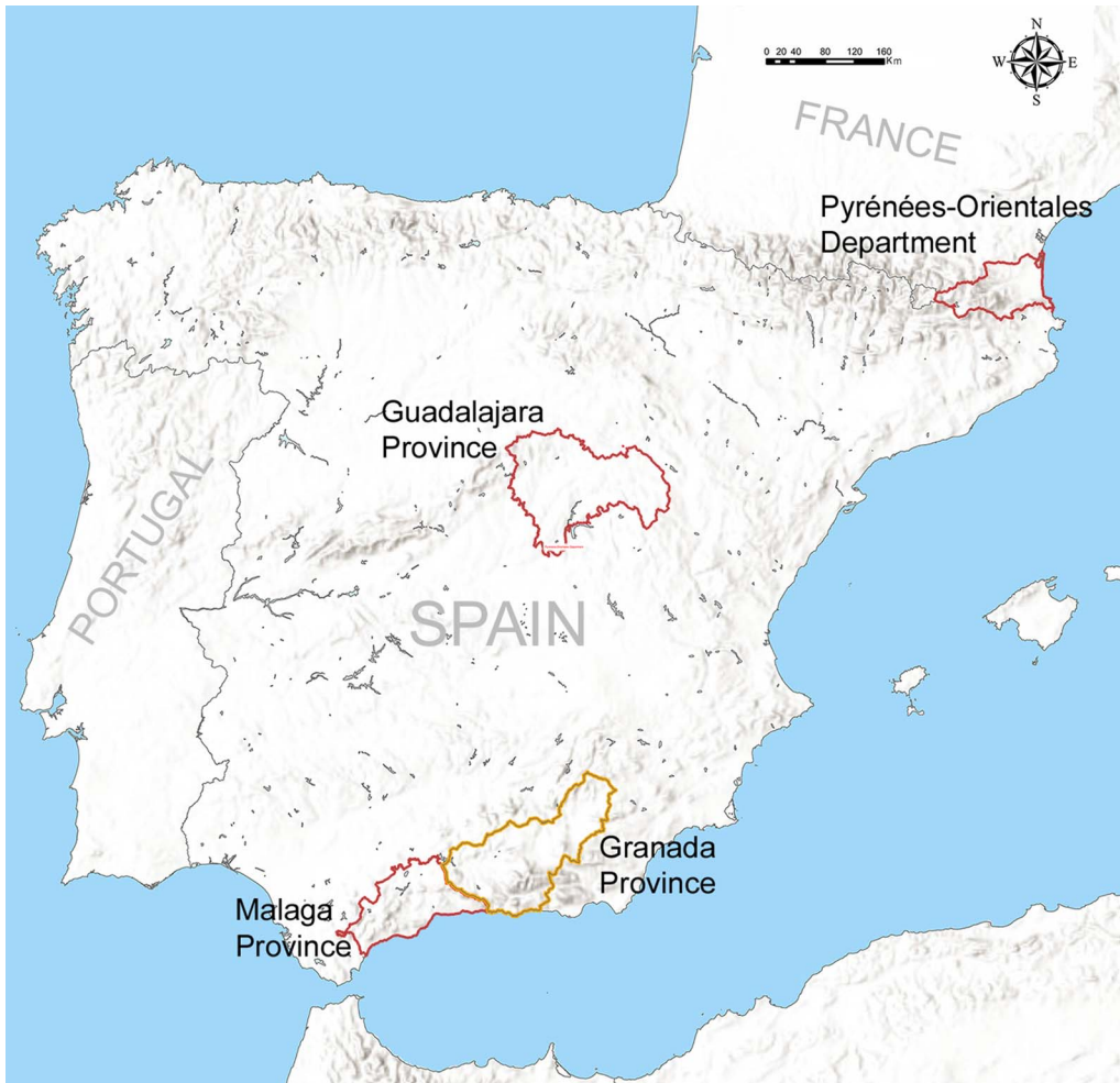
Figure 4. The case-study regions in the ‘Landscapes of (Re)Conquest’ project, showing the three primary regions and the secondary study region of Granada (figure by Aleks Pluskowski).

archaeology remain segregated from each other, more broadly from historical research, and from how these sites are presented to the public. We will integrate animal and plant remains, alongside palynological, geoarchaeological and biomolecular data, as well as the better-known historical sources, to map changes in natural resource exploitation and their connections with social and ideological transformations associated with regime changes in our selected case-study regions (Figure 5). One of the most important indicators of these changes will be long-term changes in diet based on multi-proxy data. Food culture in frontier societies connected the dietary choices of individual households with nearby rural provisioning and longer-distance trade networks (e.g. García García 2019).