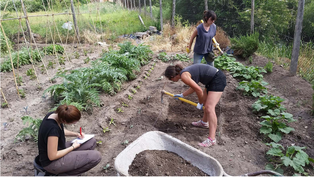
Figure 5. Excavations of a medieval irrigation channel in the town of Molina de Aragón (figure by Aleks Pluskowski).

the ability of conquered communities to adapt to the imposition of a new regime. Environmental exploitation is an increasingly used index of this resilience. From this, the LoR project will develop visual and digital resources to enable public beneficiaries to engage with the cultural landscapes associated with the iconic monuments of frontier authorities.