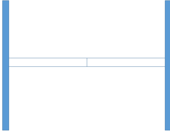
Figure 3: Ecastré beam as sum of two cantilevers.