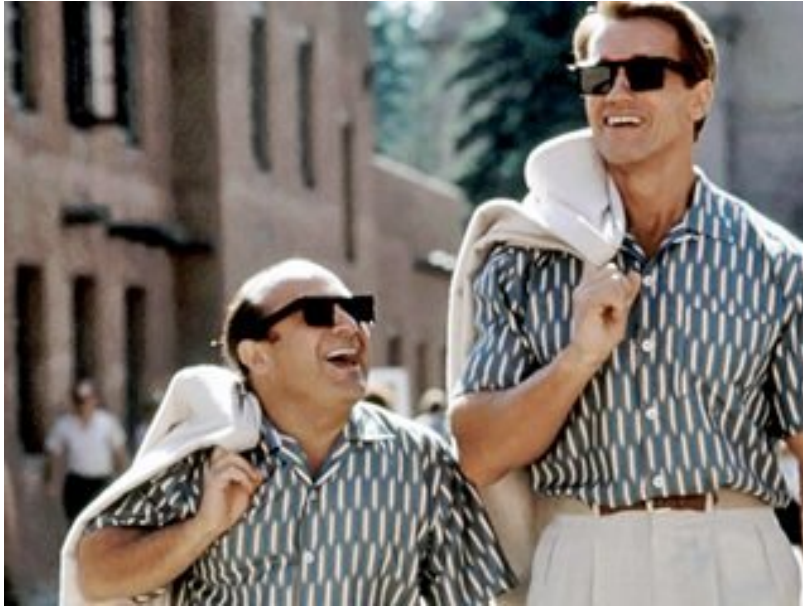
Figure 1: Fraternal (non-identical) twins (publicity still from 1988 film Twins ).

The use of the work ‘twin’ in the context of modelling is actually interesting semantically. Clearly the idea is to suggest a one-to-one relationship or identity between a structure and a model; however, this is unjustified if one refers to biology. According to recent statistics 2 , roughly one in 65 births results in twins; of these, the vast majority are fraternal - or non-identical twins (see Figure 1). Furthermore, opposite-sex twin pairs make up roughly 33% of fraternal twins. In fact, identical twins result from only one in 285 births, and even identical twins have distinct teeth marks and fingerprints. Finally, twins may look identical, but behave in completely different ways.