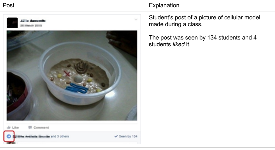
Table 4b. Post with communication