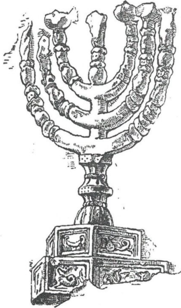
FIG. 73.—The golden candlestick, from the Arch of Titus.

Figure 2. The Golden Candlestick', in Mrs H. R. Haweis 'The Art of Decoration' (1881). No copyright.