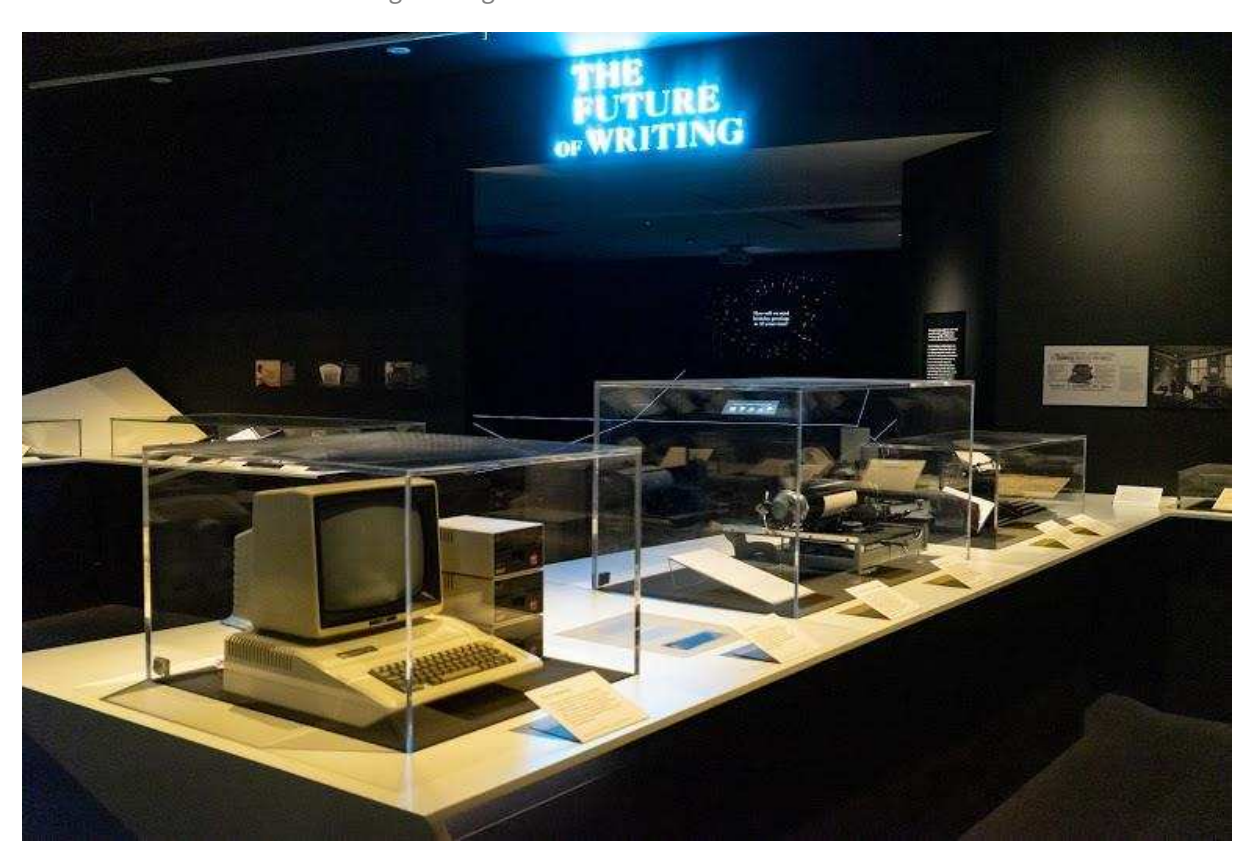
Writing - Making Your Mark at the British Library

The need for "user-friendly" scripts, due to the rise in written documentation, was demonstrated in the manipulation of text into various forms of early shorthand. A ninth-century Latin psalter from Rheims, (London, British Library ADD MS 9046), contained shorthand in a style created by Tiro (d. 4 BCE), a slave of Cicero, and expanded upon until the twelfth century. The symbols were very angular and bore a resemblance to both the characters used in cuneiform and symbols used by modern stenographers. Therefore, in an effort to advance the capabilities of writing, the scribe of the psalter appears to have employed an earlier model. This comparison highlights the benefit of juxtaposing artefacts from different periods to demonstrate their commonalities and the simultaneous development of written language.