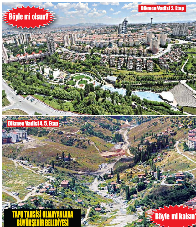
Figure 4: The cover page of the weekly Metropolitan Ankara bulletin dated 14–20 November 2011, demonstrating two photos of different parts of the Dikmen Valley urban transformation project area (public domain) [Colour figure can be viewed at wileyonlinelibrary.com ]

Stigmatisation of the insurgent was, thus, used as a political strategy to legitimise the transformation of the area as a tool for social order as well as modern urbanisation. This led to surfacing of fragmentation within the community revealed by competing political views (Özdemir and Eraydın 2017) concerning insurgence. Haydar (59), a current dweller and one of the leading figures in the struggle, told