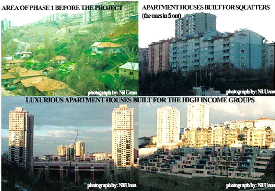
Figure 2: The apartment houses constructed for the former squatter dwellers (above) and higher income groups (below) in the first phase of Dikmen Valley Housing and Environmental Development Project (source: Uzun 2003; used here with permission) [Colour figure can be viewed at wileyonlinelibrary.com ]

the Metropol İmar Co. (Eğercioğlu and Özdemir 2006). With the intensification of density and luxurious residential uses that led to speculation, the housing project turned into state-led gentrification (Mühürdaroğlu 2005) that marks the current transformation projects in many inner-city squatter areas such as Tarlabaşı, Fikirtepe or Başibüyük in İstanbul.