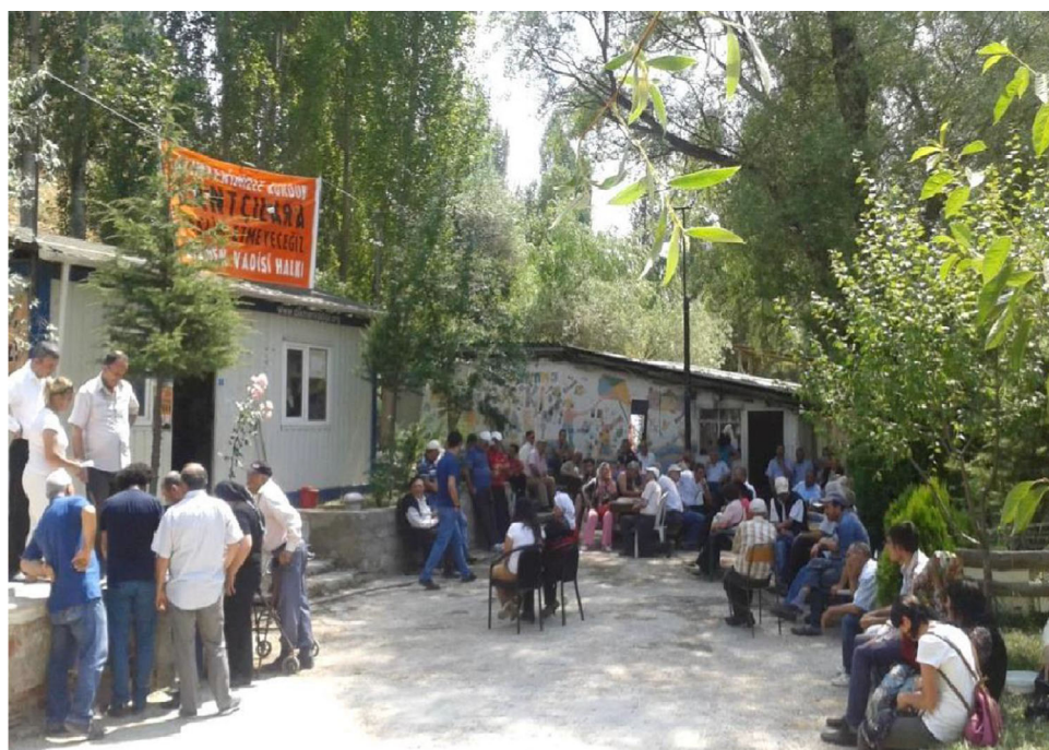
Figure 3: Squatter dwellers waiting in the garden of the “Dikmen Valley right to shelter bureau” before the weekly meeting (source: Author, 26 July 2015) [Colour figure can be viewed at wileyonlinelibrary.com ]

Dikmen Valley was mentioned more than 300 times up until the end of 2015. One-sixth of these were about the clashes between the demolition teams and the struggling groups. The news was supported by visual images of masked protestors throwing stones and setting fires using a vocabulary of warfare including “volley of stones to the police” (1 July 2011), “scenes of war” (30 November 2011), and “battlefield” (12 April 2012). Through selective attention to the clashes with the police and the demolition teams without mentioning the violence of the latter, the insurgent was racialised (Wacquant et al. 2014).