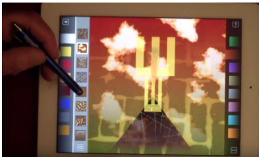
Figure 4. Scape , a musical app in which the user combines shapes to create musical compositions.

This type of casual creator spans the creation of visual art and also music. For example, in the app PendantMaker (Compton and Mateas 2015), the user makes vague patterns and the app makes a pendant from them. Similarly, in Scape , the program recombines musical elements to create new compositions (Figure 4).