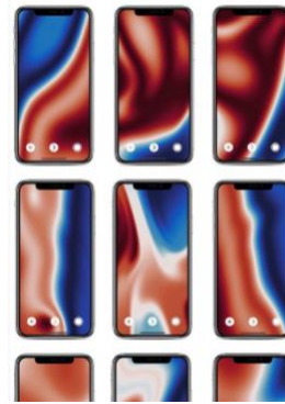
Figure 5. Kandinsky.io (Khosravi 2019) – users select their favourite wallpaper variant.