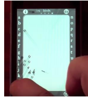
Figure 3. A user swipes the screen in the casual creator abcdefghijklmnopqrstuvwxyz to move the letters.

directs the movement of agents visualised as letters of the alphabet (with musical accompaniment) (Figure 3).