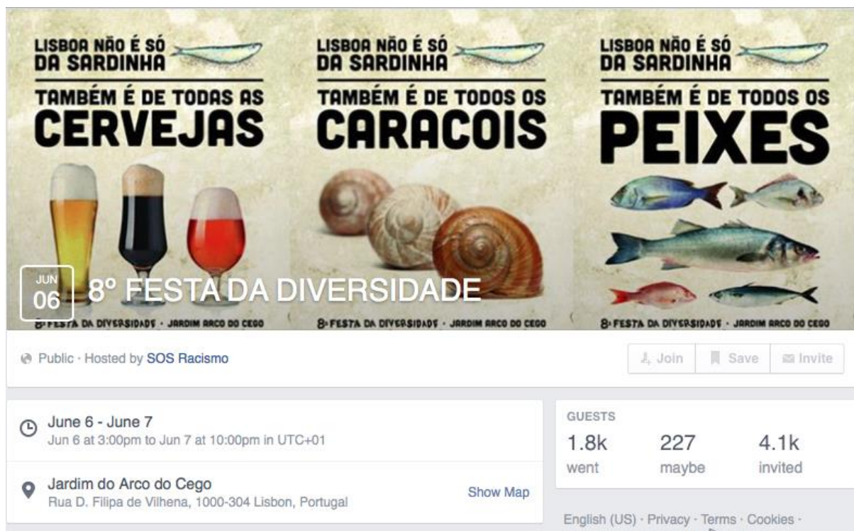
Figure 4. Screenshot from 2015 Festa da Diversidade Facebook Event: 'Lisbon is not only the Sardine's: it is also all the beers' / snails' / fishes'

homogenous group - as a shoal of sardines - is profoundly simplifying. It suggests a crushing homogeneity which does not exist. Different groups have different access to public space and urban cultural festivity and the sardines channel such exclusions (Nofre et al. 2017b). To be a sardine subject, as we have argued above, is to be distinctive but fundamentally homogenous. The city in fact, though, is built out of difference. A key event organised by EGEAC aimed at diversifying the Festas is the ' Festa Da Diversidade ' [Festival of Diversity]. In 2015 the posters promoting this event recognised the sardine's homogenising symbolism: 'Lisbon is not only the sardine. It is also all the other fish'. EGEAC, therefore, were implicitly accepting that the sardine-person is normatively white and European. Certainly, they cater to a particular audience: the traditional elements of the Festas are largely practised by Catholic, white European citizens, and the beer, sardines and dancing in the streets predominately appear to be enjoyed by Lisbon's white middle-classes and tourists (Interviews with Immigrants and Associação Renovar a Mouraria and observations).