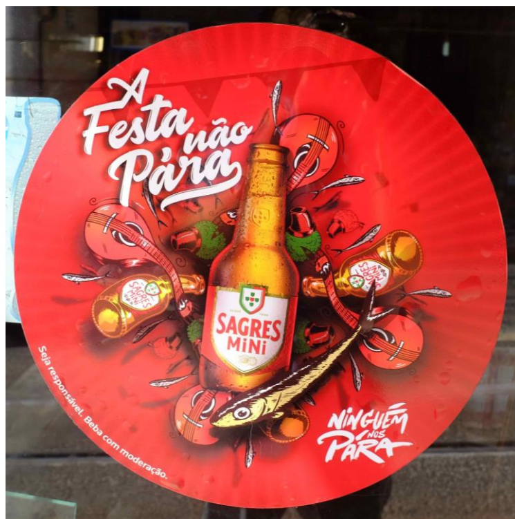
Figure 3. Beer advert featuring sardines