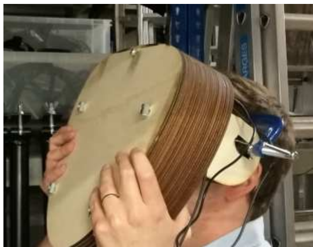
Figure 2: User testing the Viking VR headset

from multiple disciplines and specialisms, from both partner organisations, was drawn on during the design and development stages. This included academics from Archaeology, TFTI, Electronics and English specialising in game design, electronics, historic languages and museum studies, and Yorkshire Museum's curation, digital engagement, education and visitor management teams.