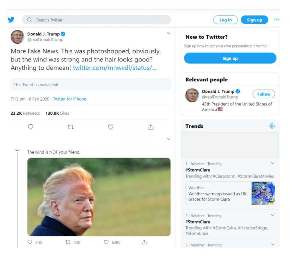
Figure 1. Controversial Image on Twitter Dated February 8, 2020.

Dihydroxyacetone (DHA), the primary ingredient used in most sunless tanning products, is known to lead to changes in skin colour (Wittgenstein & Berry, 1960). We measured this shift in skin colour in a Caucasian sample and then compared the resulting colours with the natural range of skin colours (Xiao et al., 2017). The two sets of data points are shown on the right side of Figure 2, together with the ellipses denoting a 95% confidence region, in a standard CIELAB colour space (Luo, 2016). Skin colour can be described by three values: L^* , lightness—from black (0) to white (100); a^* , green (–) to red (+); and b^* , blue (–) to yellow (+). The space is designed to model our perceptual sensitivity to colour differences, taking into account the illumination. A good way to characterise skin tans is to look at L^* and b^* values, that is, skin lightness versus yellowness.