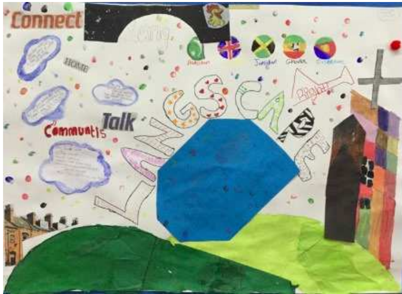
Figure 1: Collage example

A translinguaging perspective gave us an alternative lens for the activity. The young people approached the activity in different ways. Some focused on image, some focused on text with others brought together a mixture of the two. Participants also started to introduce texture and additional imagery into their work through the addition of coloured tissue paper and by using acrylic paints. Figures 1-3 are taken from the activities carried out in the east of the city. Figure 1 shows how photographs of terraced houses taken during the fieldwork exercise are juxtaposed with quotations from interviews carried out by the young people and extracts from books used during the creative writing workshop. A series of flags are depicted in the top right hand corner and the word 'Landscape' features centrally. The clouds show excerpts of 'data' from the fieldwork exercise conducted by the young people. Although the terraced houses are typical of the area, the green hills at the bottom of the collage are unexpected, although the educational centre was situated next to a park area. Where images were used as a reference for drawn imagery, participants used their smartphones to find additional inspiration, therefore incorporating an element of digital literacy into the process.