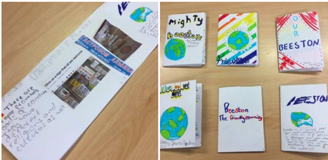
Figures 4, 5, 6, 7: Examples of zines

The young people focused on the site of the workshops as being an area which needed to be promoted. They drew on the diversity - linguistic and cultural - of the area, as explored during the fieldwork exercise. The globe featured as an image across a number of the zines (see Figure 7), connecting the local with the global, again linking to their explorations of the area and their lived experiences of it as multilingual residents of Leeds.