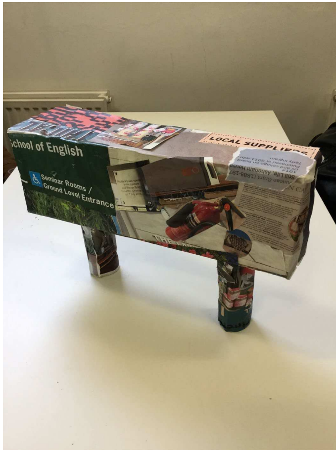
Figure 8: Example of collage sculpture

The sculpture activity extended the collage work done previously to enable the young people to play with shape and structure, therefore responding to the architectural features of the linguistic landscape of the university. The shared making process required negotiation of which observations would be interwoven to create the sculptures.