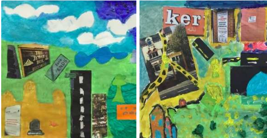
Figures 2 and 3: Collage examples