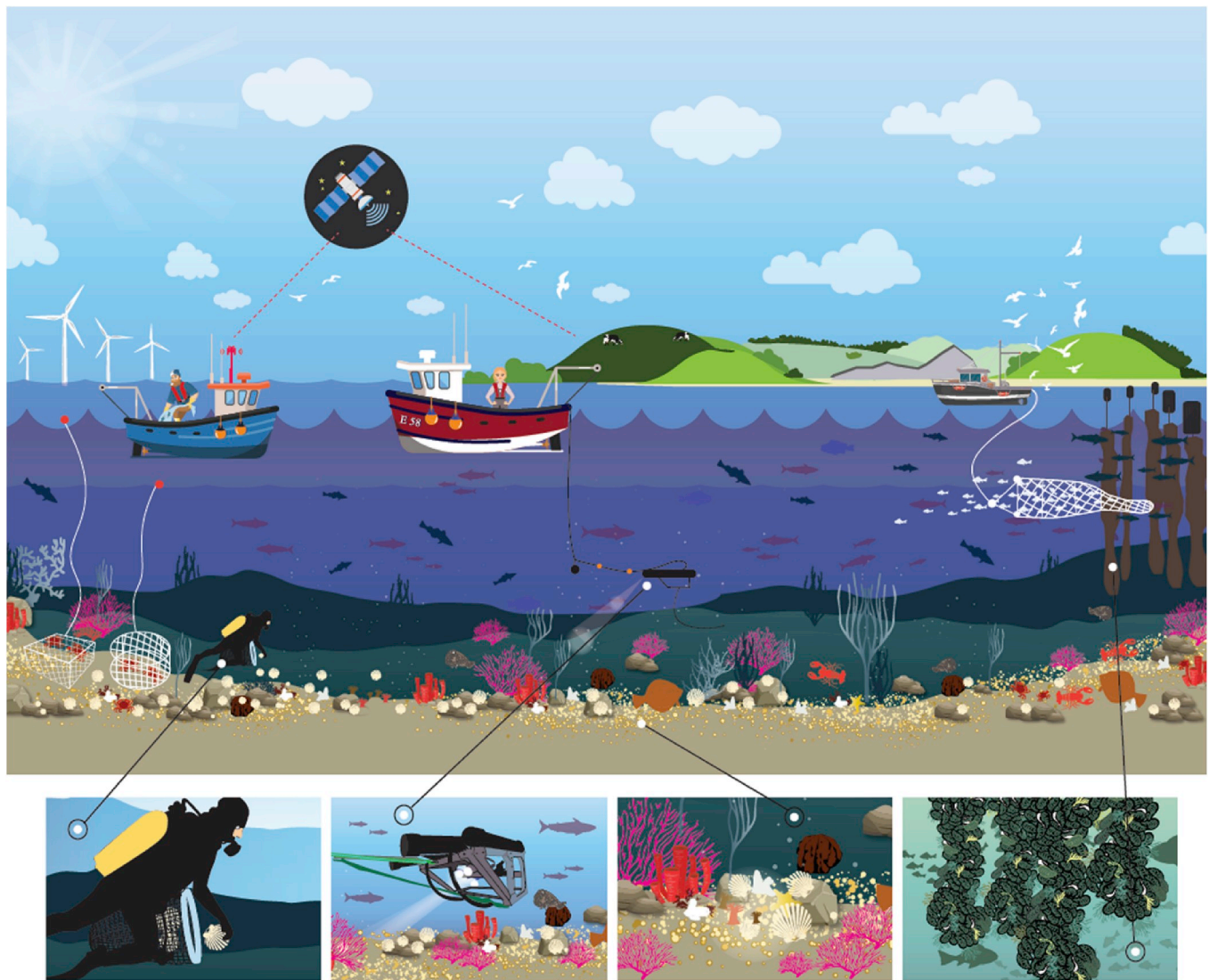
Fig. 1. Ambitious marine conservation 1) Reflects an ambition for sustainable livelihoods by fully integrating fisheries management with conservation (Ecosystem Based Fisheries Management) as the two are critically interdependent; 2) Establishes a world class and cost effective ecological and socio-economic monitoring and evaluation framework that includes the use of controls and Sentinel Sites to improve sustainability in marine management; 3) Requires a shift from managing individual marine features within MPAs to whole-sites to enable repair and renewal of marine systems; and 4) Challenges policy makers and practitioners to integrate MPAs into the wider seascape as critical functional components rather than a competing interest and move beyond MPAs as the only tool to underpin the benefits derived from marine ecosystems by identifying other effective area-based conservation measures (OECMs) to establish synergies with wider governance frameworks.

Within the EU Marine Strategy Framework Directive (Directive 2008/56/EC) sea-floor integrity is a descriptor used to assess Good Environmental Status [47]. Good Environmental Status is considered to be met when, ‘sea-floor integrity is at a level that ensures that the structure and functions of the ecosystems are safeguarded and benthic ecosystems, in particular, are not adversely affected’ [48].