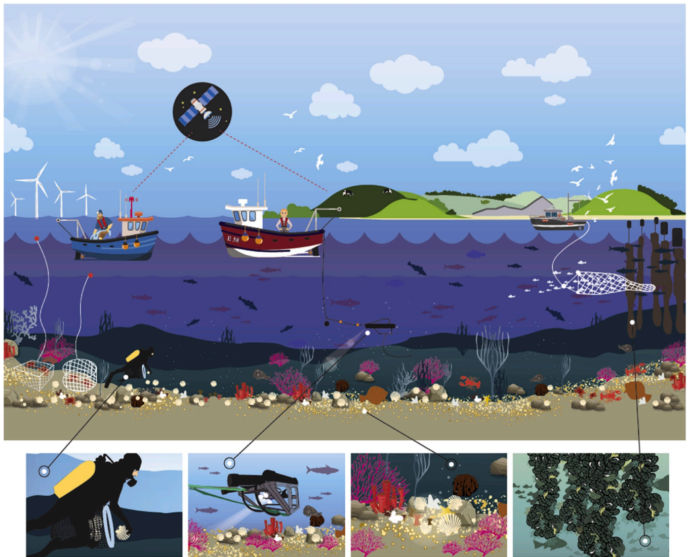
Fig. 1. Ambitious marine conservation 1) Reflects an ambition for sustainable livelihoods by fully integrating fisheries management with conservation (Ecosystem Based Fisheries Management) as the two are critically interdependent; 2) Establishes a world class and cost effective ecological and socio-economic monitoring and evaluation framework that includes the use of controls and Sentinel Sites to improve sustainability in marine management; 3) Requires a shift from managing individual marine features within MPAs to whole-sites to enable repair and renewal of marine systems; and 4) Challenges policy makers and practitioners to integrate MPAs into the wider seascape as critical functional components rather than a competing interest and move beyond MPAs as the only tool to underpin the benefits derived from marine ecosystems by identifying other effective area-based conservation measures (OECMs) to establish synergies with wider governance frameworks.

Within the EU Marine Strategy Framework Directive (Directive 2008/56/EC) sea-floor integrity is a descriptor used to assess Good Environmental Status [47]. Good Environmental Status is considered to be met when, ‘sea-floor integrity is at a level that ensures that the structure and functions of the ecosystems are safeguarded and benthic ecosystems, in particular, are not adversely affected’ [48].