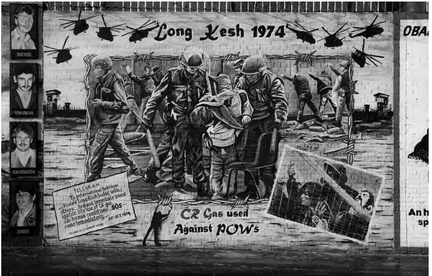
Photograph 15. Long Kesh mural Divis Street