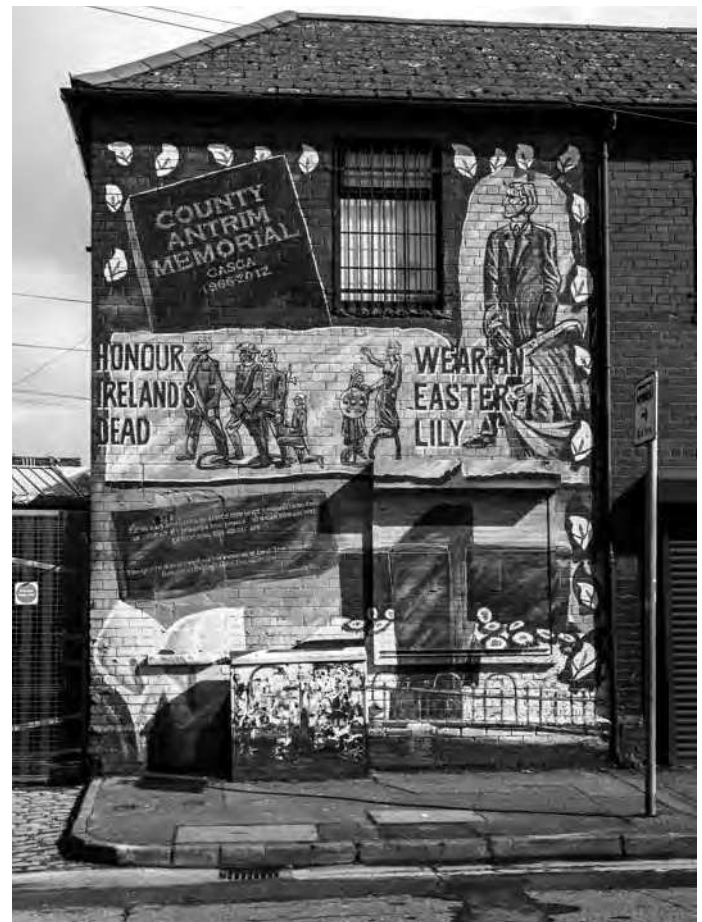
Photograph 12. County Antrim memorial Beechmont Avenue