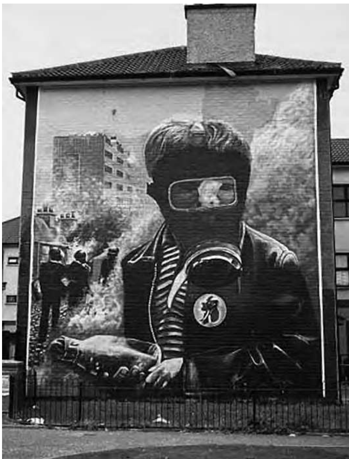
Photograph 21. The Petrol Bomber Rossville Street Derry (© The Bogside Artists, reprinted here with permission)

As soon as I enter into a relation with the other, with the gaze, look, request, love, command, or call of the other, I know that I can respond only by sacrificing ethics, that is, by sacrificing whatever obliges me to