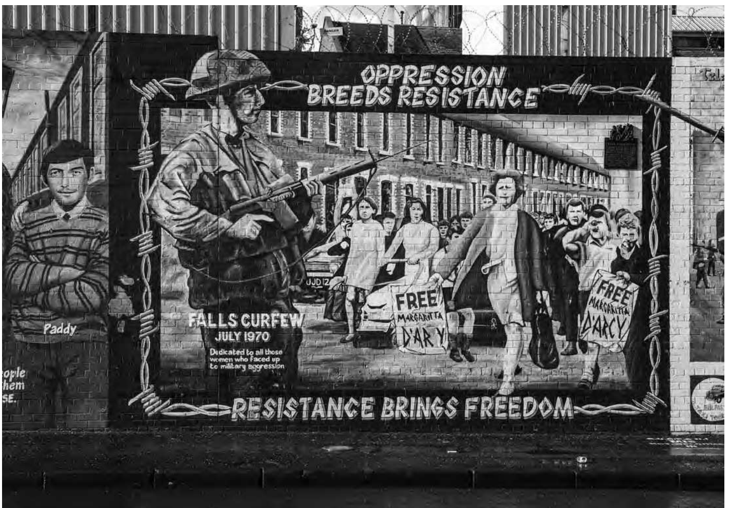
Photograph 16. Falls Curfew oppression mural Divis Street.