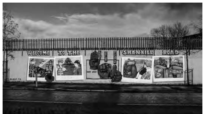
Photograph 3. Protestant mural – Welcome to Shankill between communities.