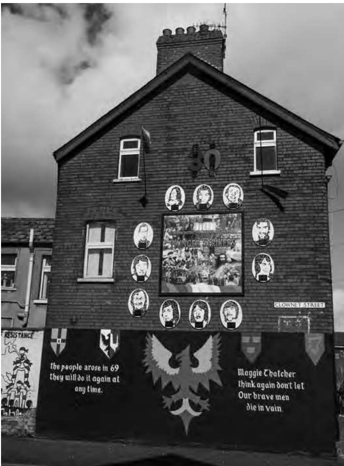
Photograph 11. Hunger strikers memorial mural Clowney Street

However, the style has since broadened even further to commemorating innocent victims, to drawing attention to suppressed issues (such as the continued use of plastic bullets – Photograph 17) and making connections to trade union issue, international political prisoners, and ultimately global peace. There are now murals commemorating Belfast