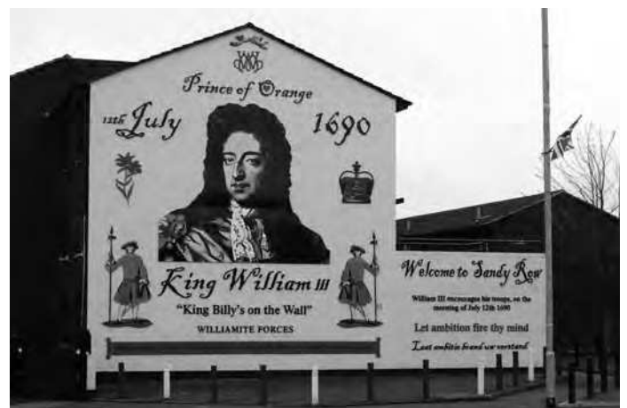
Photograph 2. Protestant mural – King Billy, Sandy Row