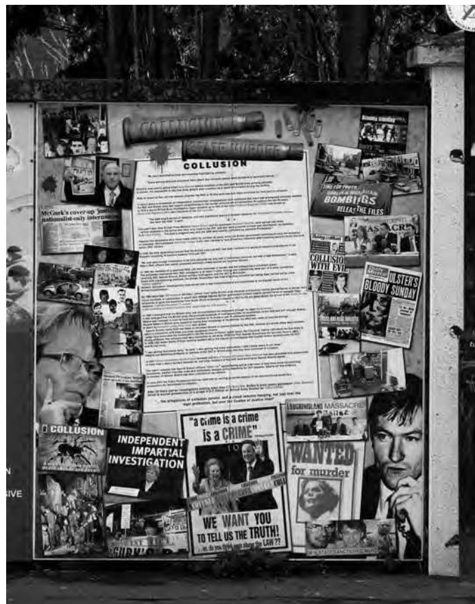
Photograph 17. Plastic bullets campaign